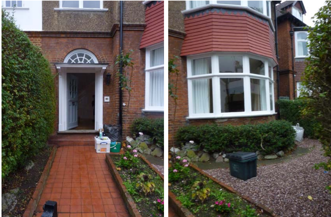
Existing garden to front of property

No. 8 Antrim Grove is in the middle of a trio of semi-detached dwellings set back behind landscaped front gardens of approximately 6 Meters depth. Side alleyways connect to rear gardens of approximately 14 Metre depth which rise in elevation following the generally rising topography of Haverstock Hill. The garden of No. 8 comprises a shallow, level pathway with a raised lawn area with planted borders. The gardens are a typically compact size for the Belsize Conservation Area although this terrace benefits from the privacy and aspect afforded by the adjacent allotments. There are no mature tree specimens in either the front or rear garden although there is a large sycamore in the adjoining garden to the rear. A tree report has been prepared by professional arboriculturists, ACS Consulting to assess the proposed scheme and direct the position of the proposed basement.