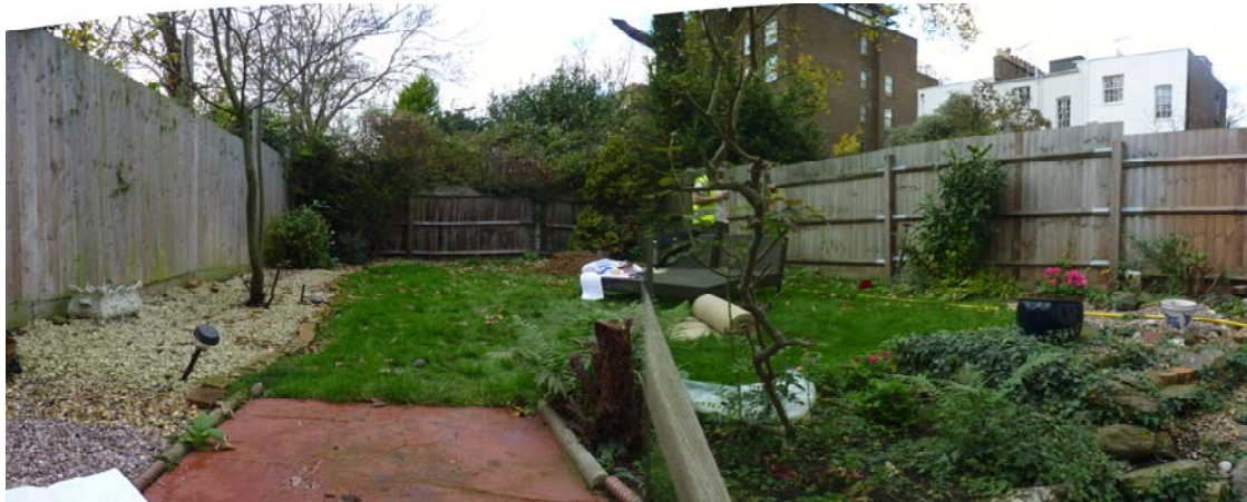
Existing garden to rear of property

No. 8 Antrim Grove is in the middle of a trio of semi-detached dwellings set back behind landscaped front gardens of approximately 6 Meters depth. Side alleyways connect to rear gardens of approximately 14 Metre depth which rise in elevation following the generally rising topography of Haverstock Hill. The garden of No. 8 comprises a shallow, level pathway with a raised lawn area with planted borders. The gardens are a typically compact size for the Belsize Conservation Area although this terrace benefits from the privacy and aspect afforded by the adjacent allotments. There are no mature tree specimens in either the front or rear garden although there is a large sycamore in the adjoining garden to the rear. A tree report has been prepared by professional arboriculturists, ACS Consulting to assess the proposed scheme and direct the position of the proposed basement.