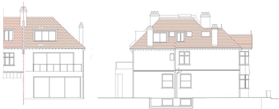
Proposed rear & side elevations showing dormers

Natural light will be brought into the basement via discreet openings including lightwells in the side alley and glass floor panels to the front and rear of the interior as well as a recessed glass wall onto a new light well and escape stair in the rear garden. The loss of garden area would be minimal and would not have a visual impact on the character of the Conservation Area. The proposed accommodation has been carefully considered to make the best use of the available amenity. The excavation is planned to achieve a ceiling height identical to the existing ground floor in the new storey so that the new level would enjoy a bright and spacious feel.