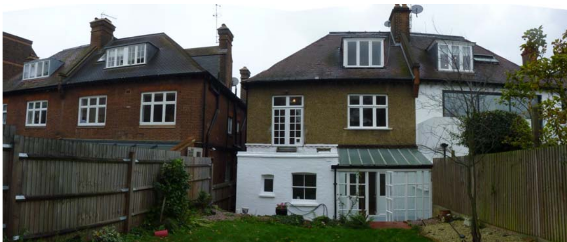
View of rear of terrace at Antrim Grove