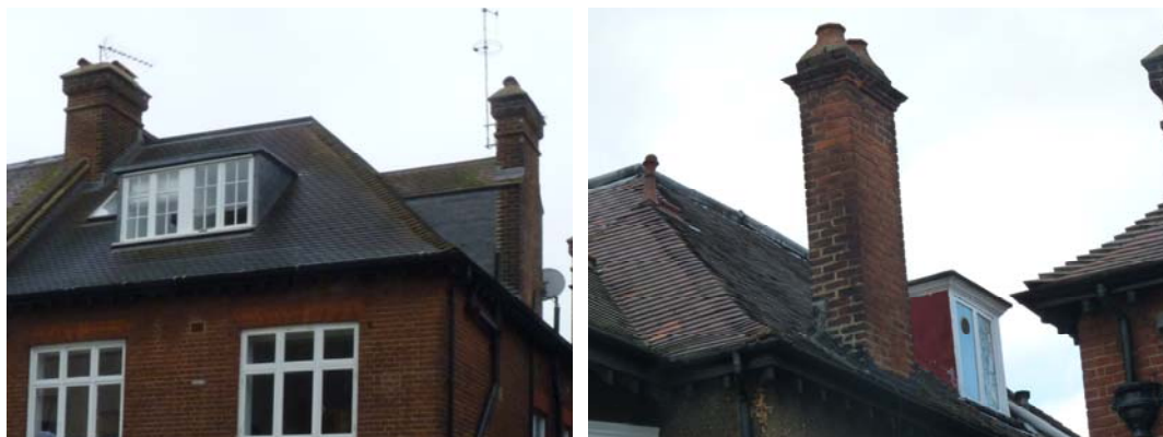
Existing dormers on roof of No's 6 & 8

Modifications to the roofscape are proposed to improve the accommodation in the existing 2 nd floor rooms at the rear and side of the house. The existing rear dormer would be widened by a single window bay and the window would be replaced to match the modern character of those on the lower stories. The revised width would be consistent with that on No.'s 4, 6, & 14 Antrim Grove and would match the widening granted for No. 10 last year. It is also proposed to widen an existing and build a new dormer onto the side roof of No. 8. In both cases the new dormers have been sized so that they are set far back from the hipped ridge, eaves and top ridge of the main roof form and their height and proportion are consistent with the period of the dwelling.