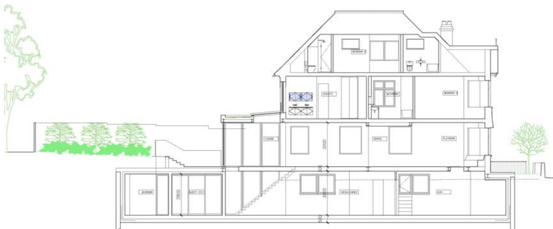
Proposed longitudinal section

The completed garden after the works would contribute fully to the verdant character of this part of the Belsize Conservation Area, and would maintain its amenity value for both this dwelling and the outlook of neighbouring properties.