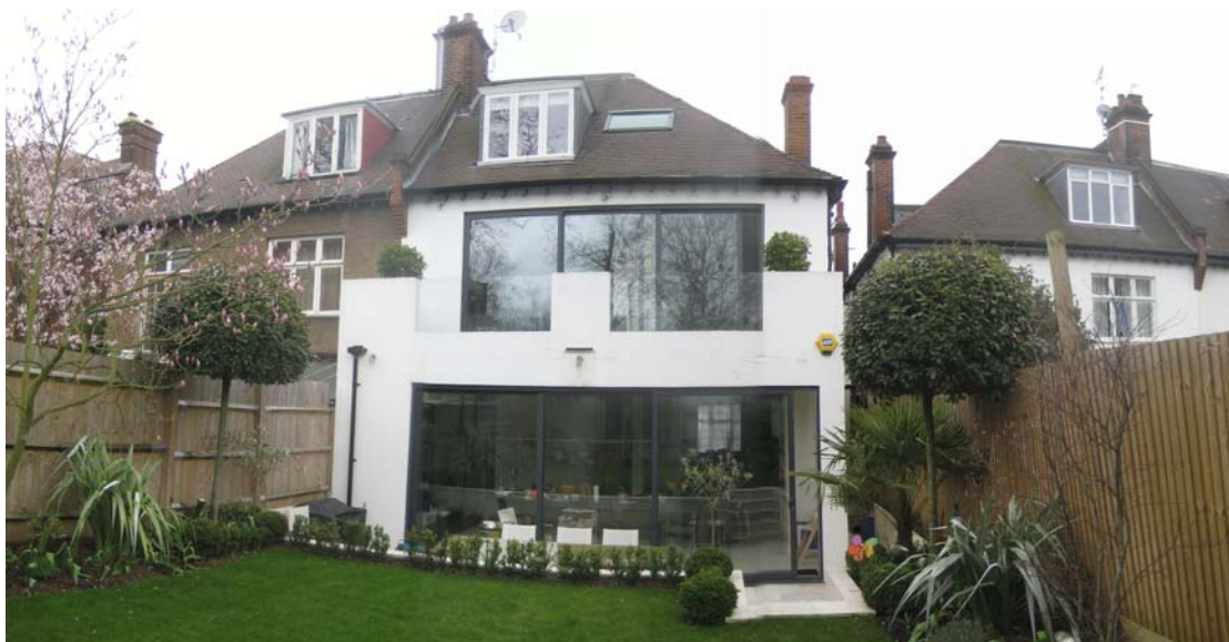
Rear of No 10 Antrim Grove

Antrim Grove is located at the eastern boundary of the Belsize Conservation Area, but No. 15 is the only property that is listed. The dwelling at No. 8 was converted to flats at one stage but consent was granted in 2002 to reconvert the property back to a single family dwelling (PWX0202425). In other respects the property is effectively in its original state and now requires substantial refurbishment and modernisation to allow it to serve as a family home. The adjoining property, No. 10, was extensively refurbished a few years ago. To the rear, a suite of single storey elements was demolished and replaced with a new glazed extension. The first floor was also modified to create a large glazed opening onto the main bedroom suite. The existing 2 nd floor accommodation was renovated and several new rooflights were inserted in the side and rear roof slopes.