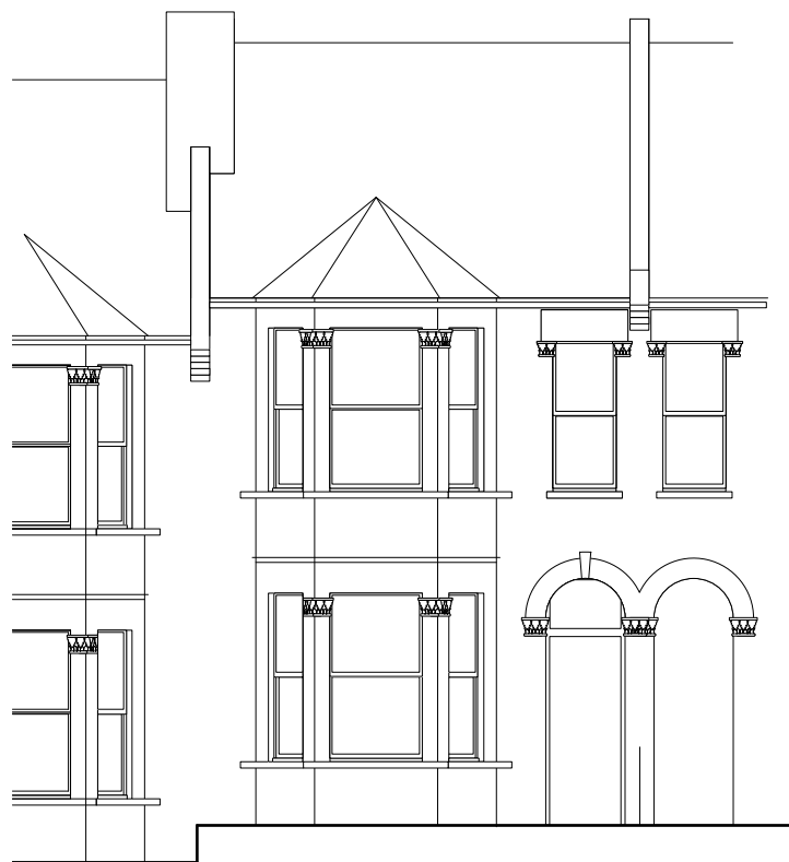
existing east elevation