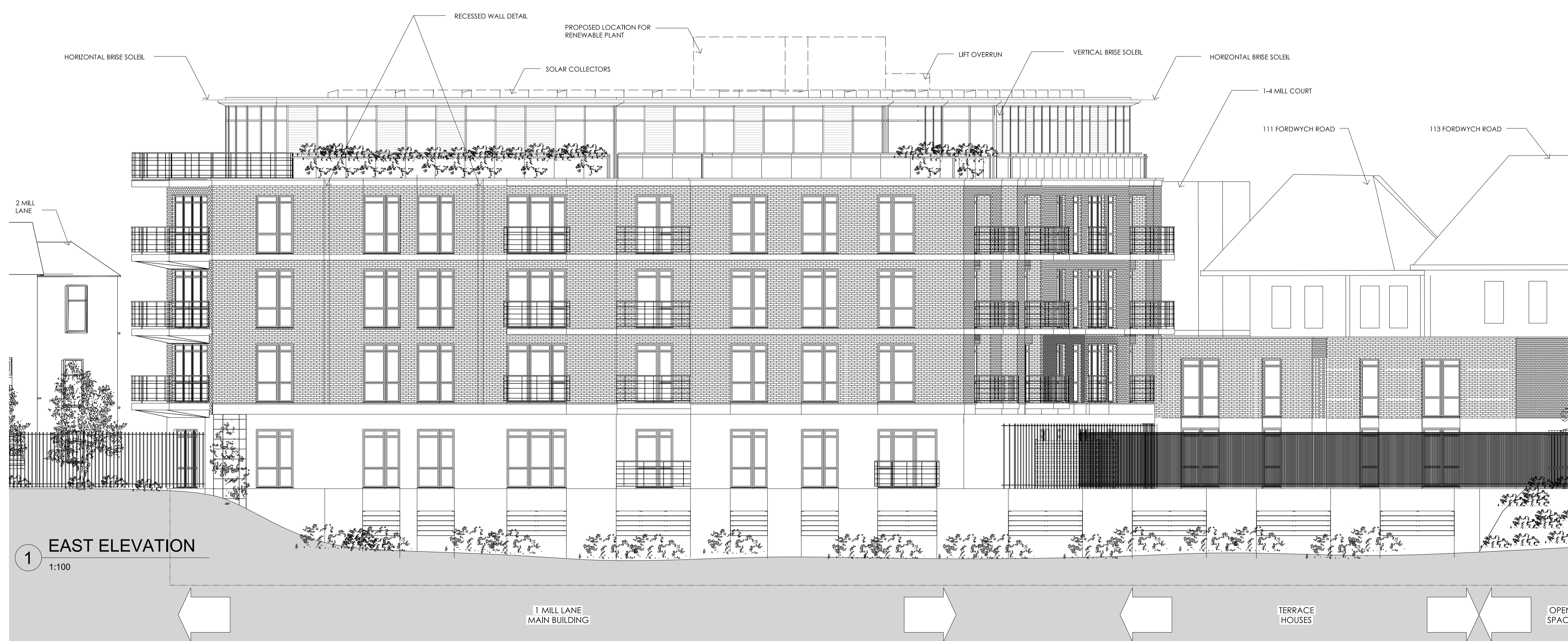
1 EAST ELEVATION 1:100