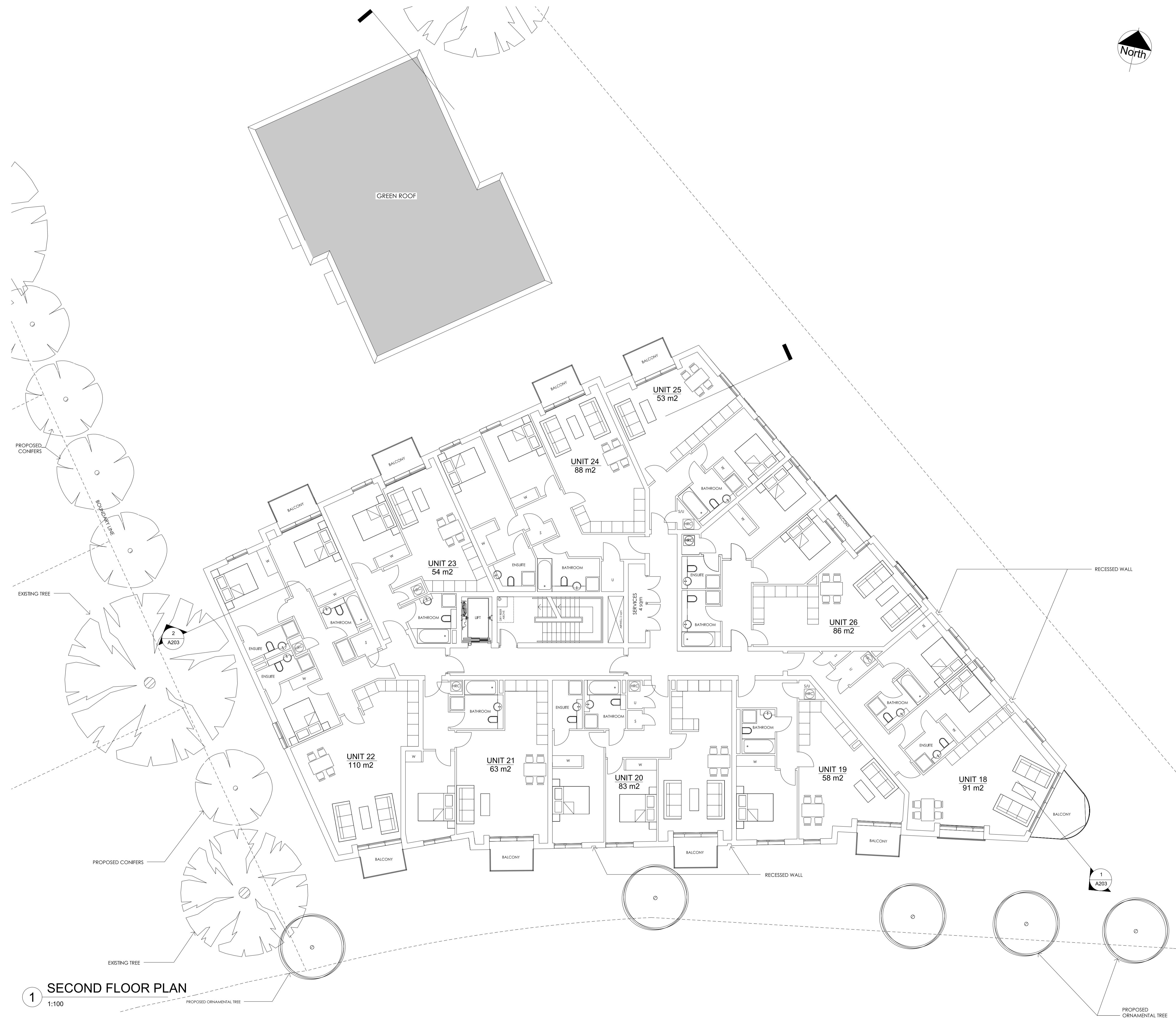
1 SECOND FLOOR PLAN 1:100