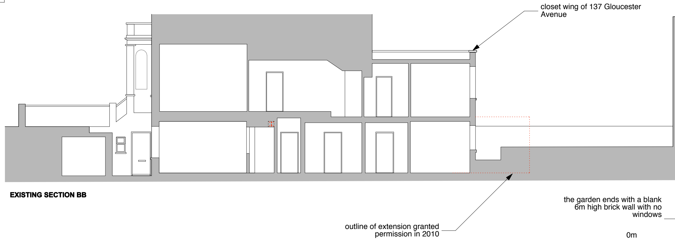
EXISTING SECTION BB

outline of extension granted permission in 2010