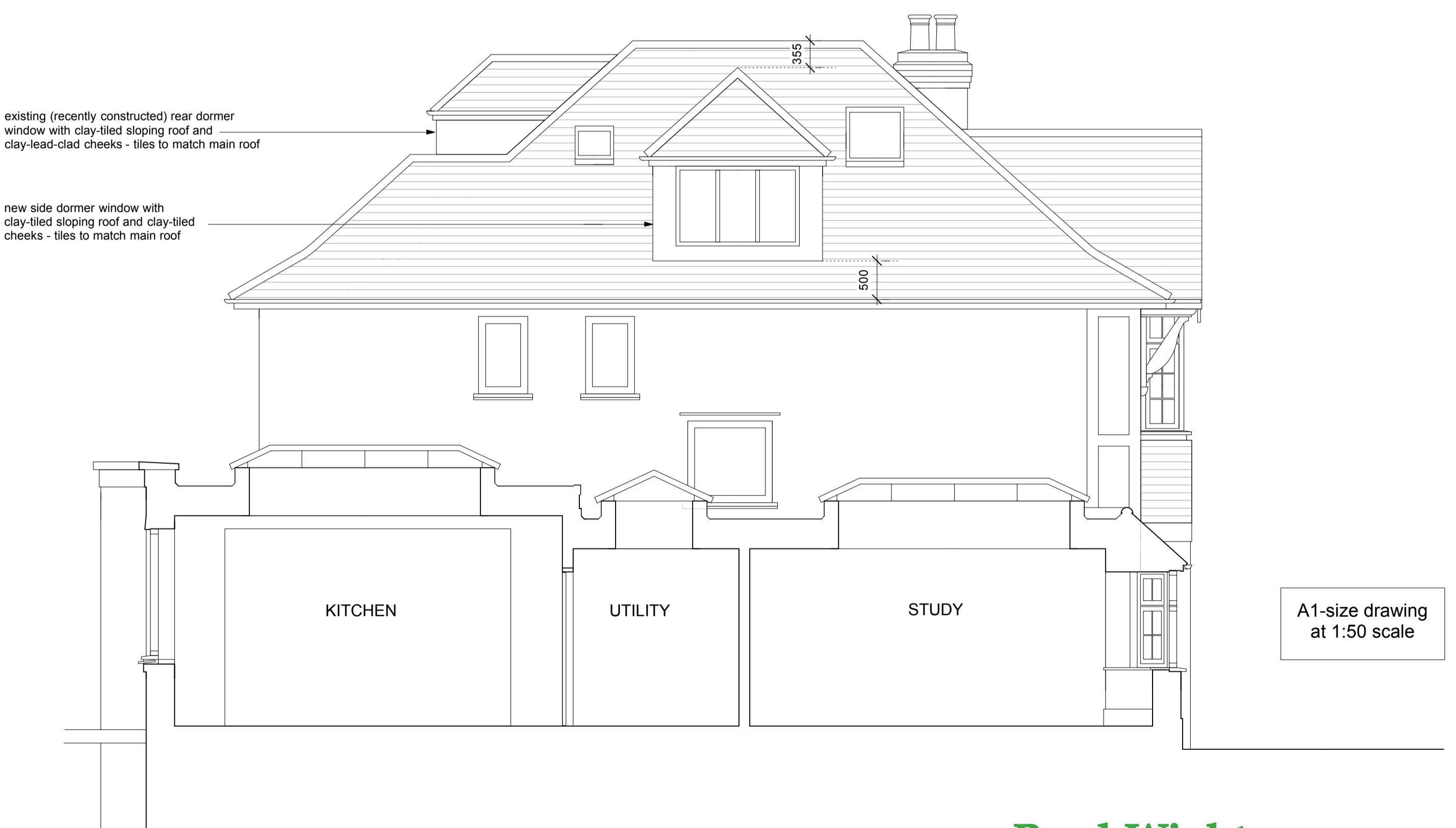
NORTH ELEVATION - PROPOSED