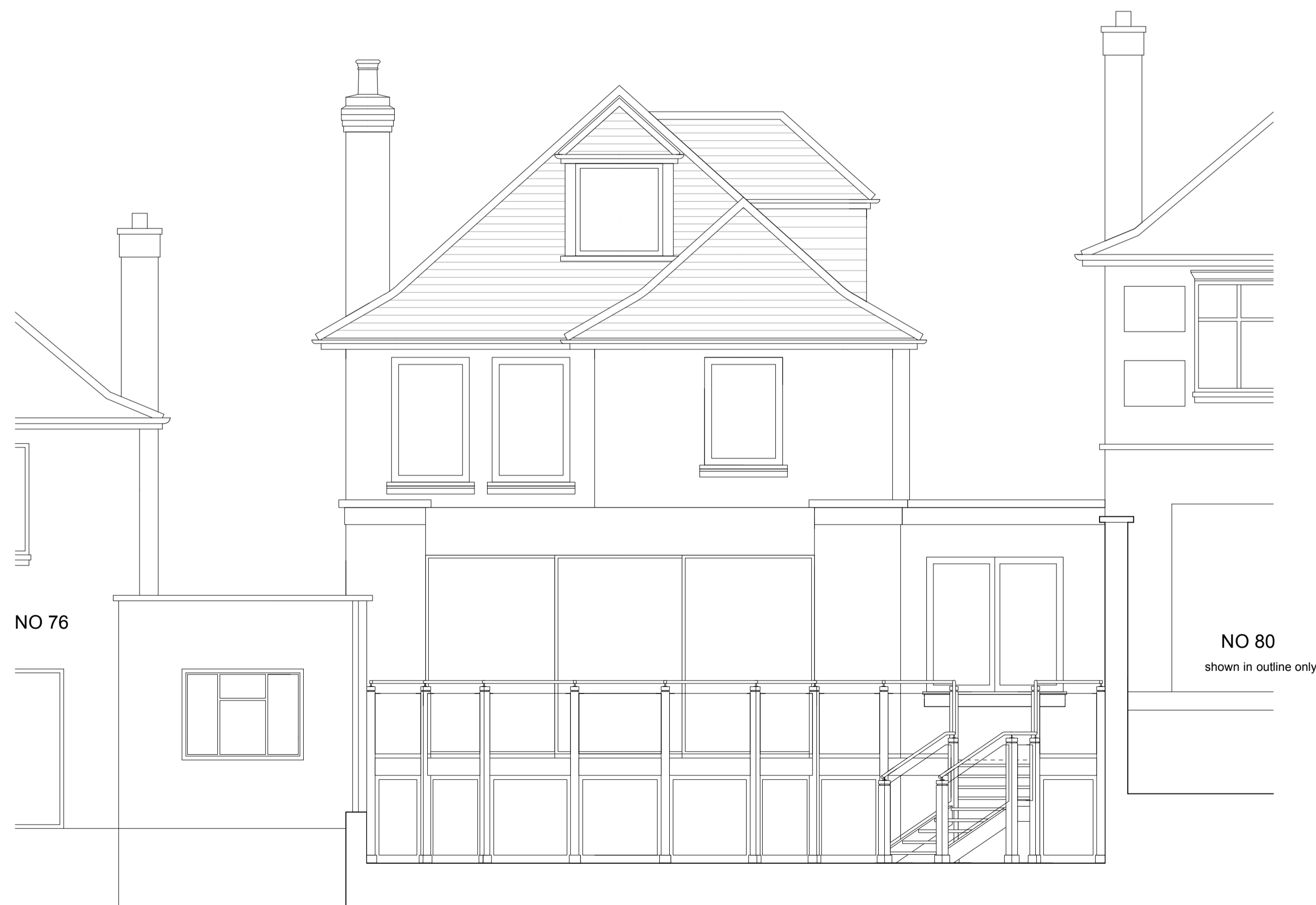
EAST ELEVATION TO GARDEN - PROPOSED