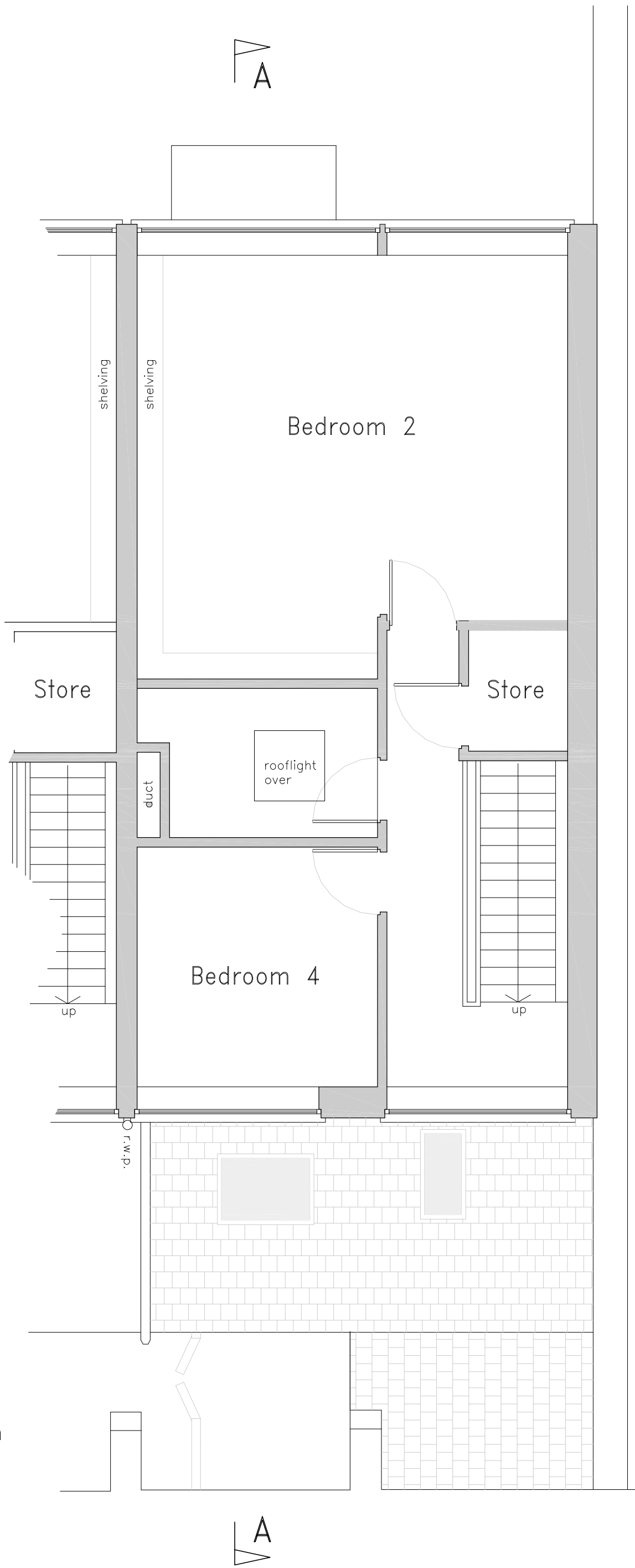
Proposed Second Floor Plan (1:50)