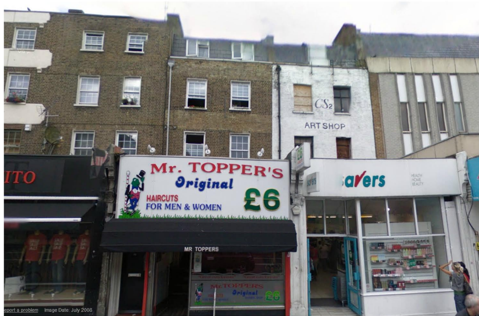
Street view of site Image right shows minimal impact of aerial