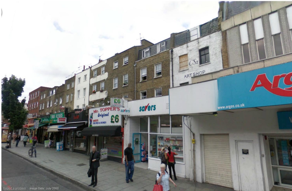
Street view of site Image right shows minimal impact of aerial