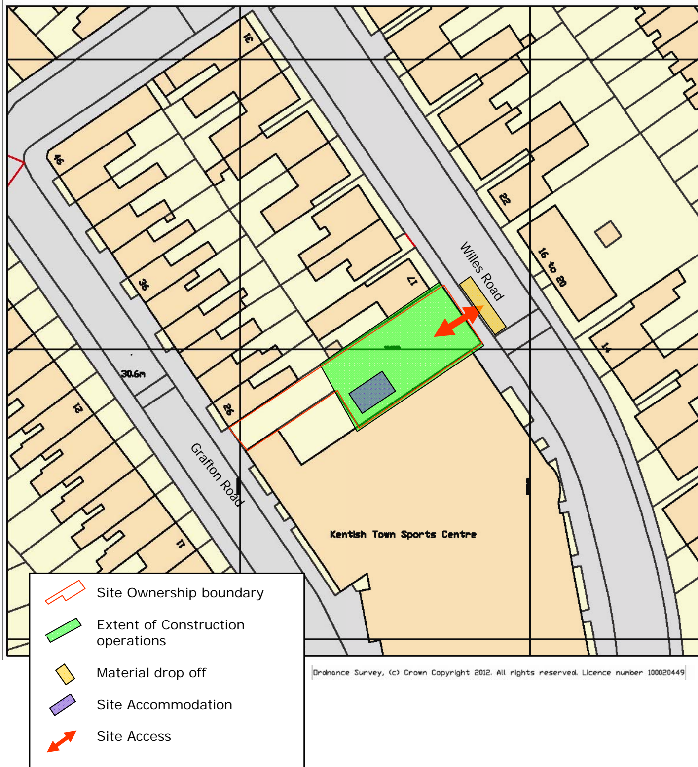
PROPOSED SITE SET UP, PHASE 2