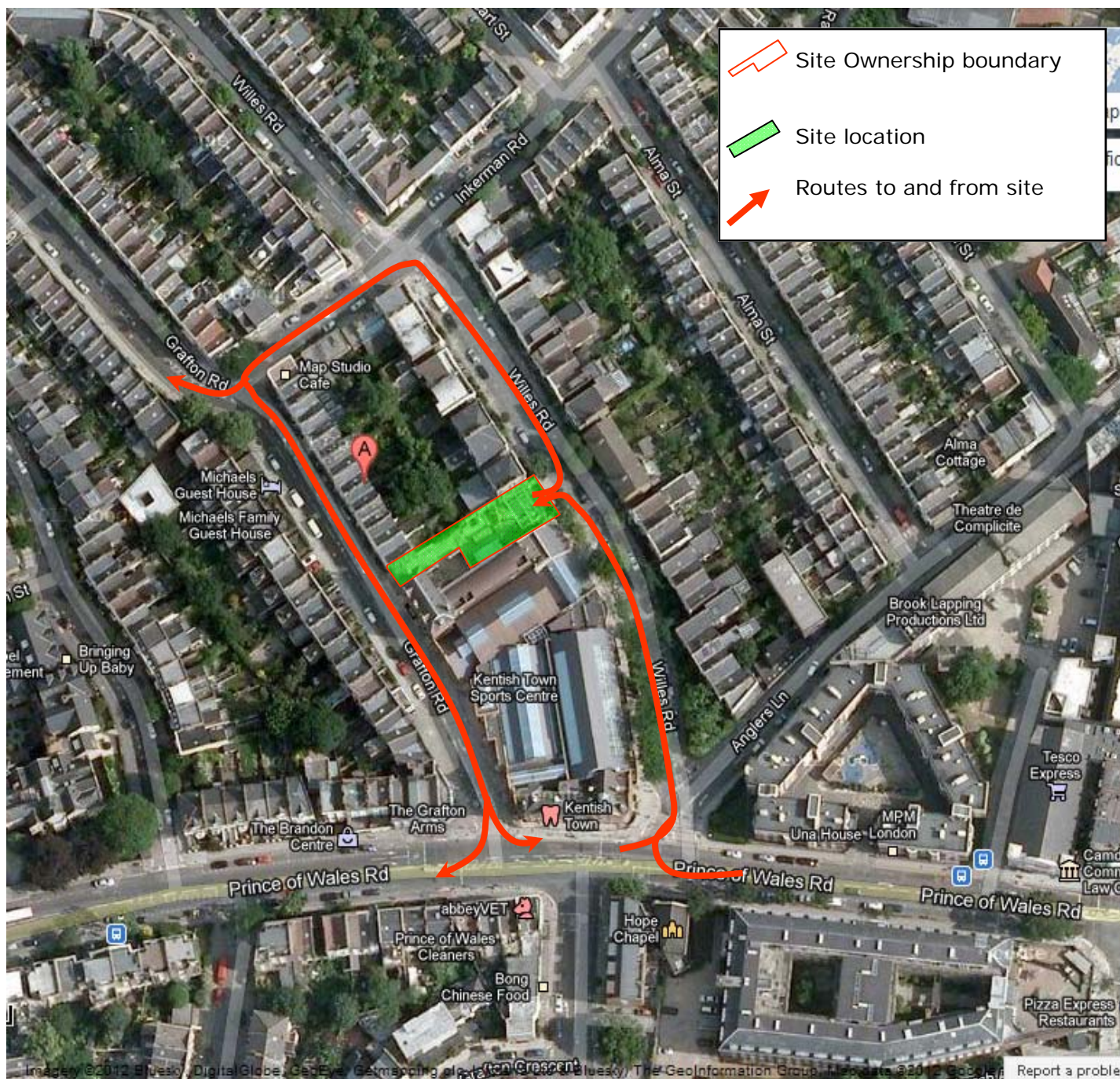
SITE ACCESS PLAN