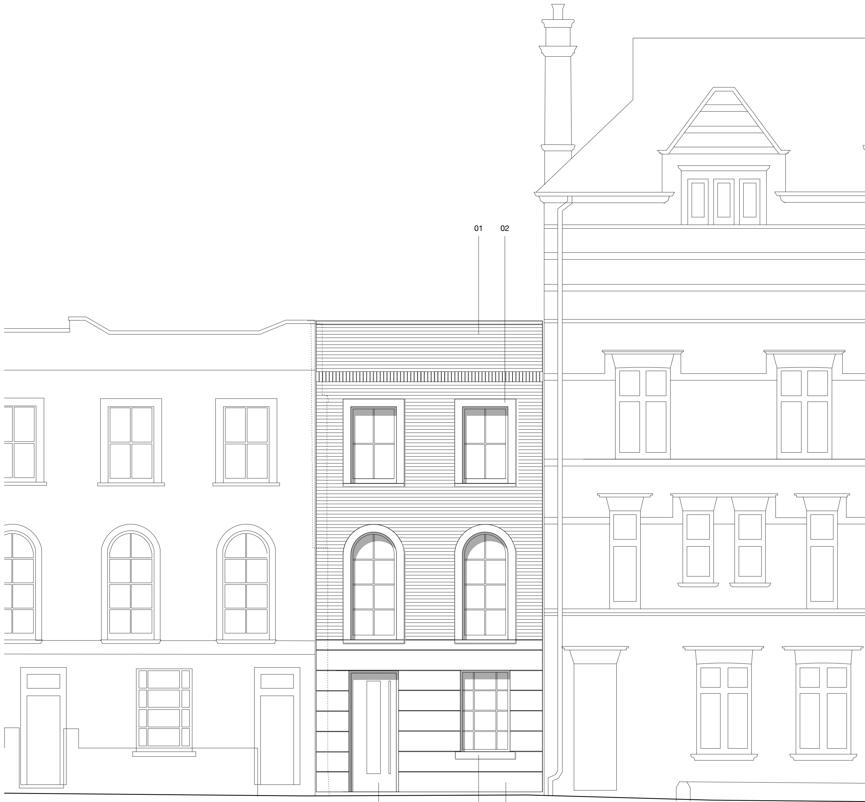
01 FRONT ELEVATION Scale : 1: 50