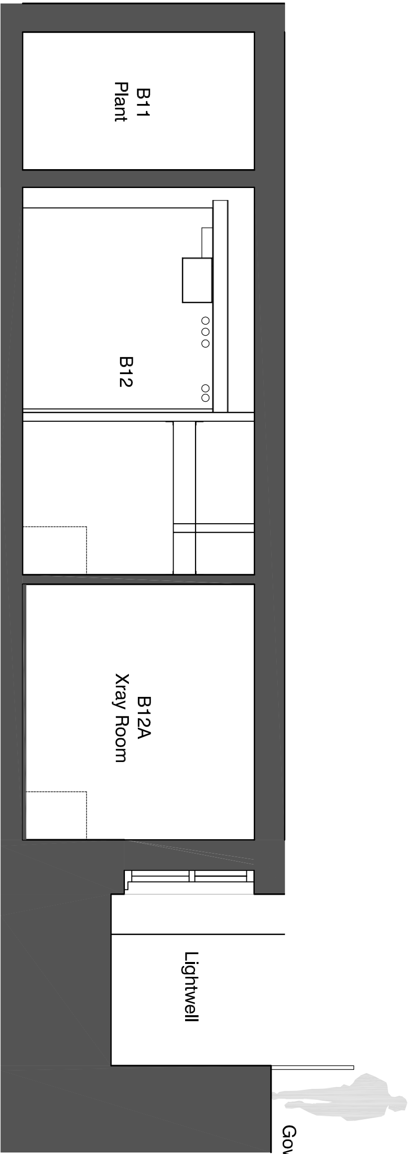
Existing Section BB - Scale 1:50