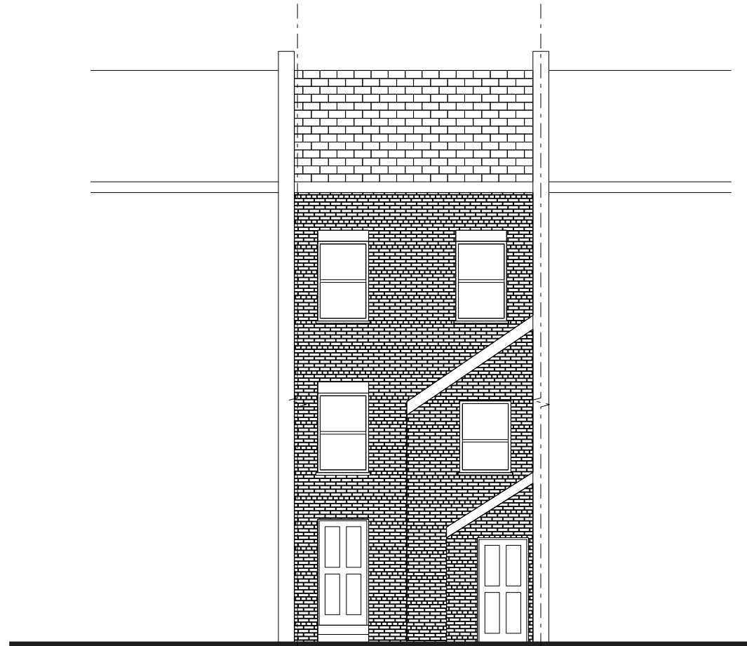
2 Rear elevation as existing 151_16 Scale 1:100 @ A3