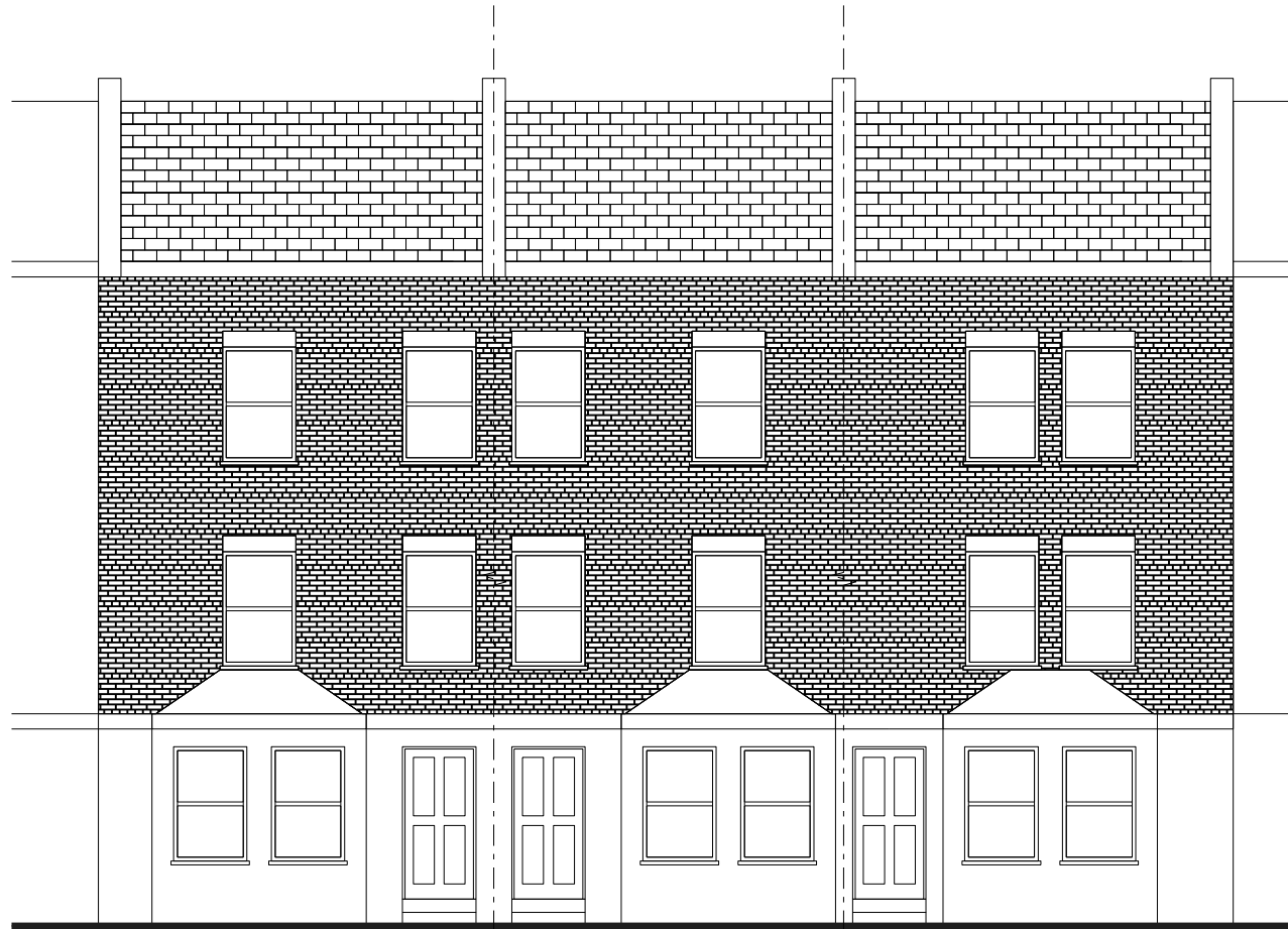
1 Front elevation as existing 151_16 Scale 1:100 @ A3