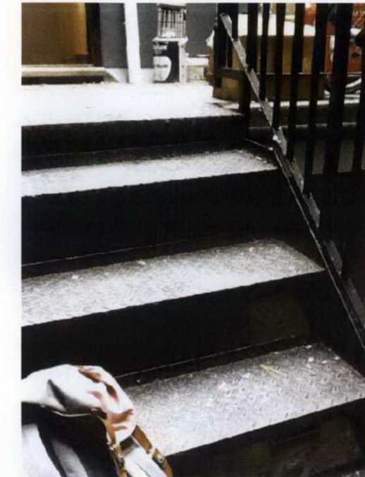
Staircase leading from the clock house down to 31 Hatton Wall

The Clockhouse 82 Leather Lane, London Planning A3 – Rear stair in context