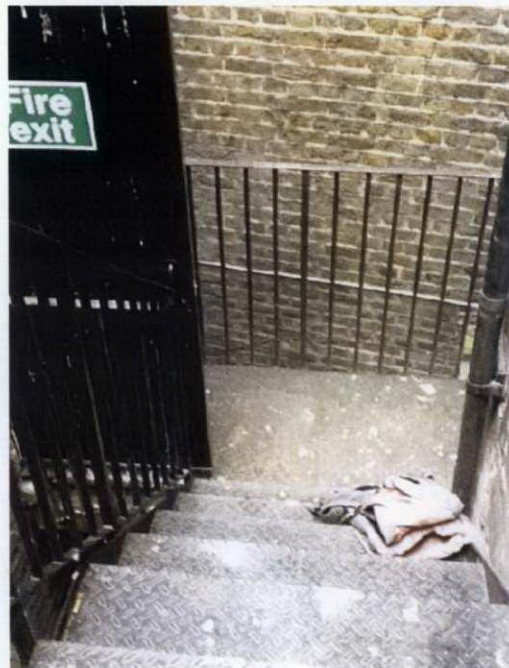
Rear reciprocal escape through 31 Hatton Wall