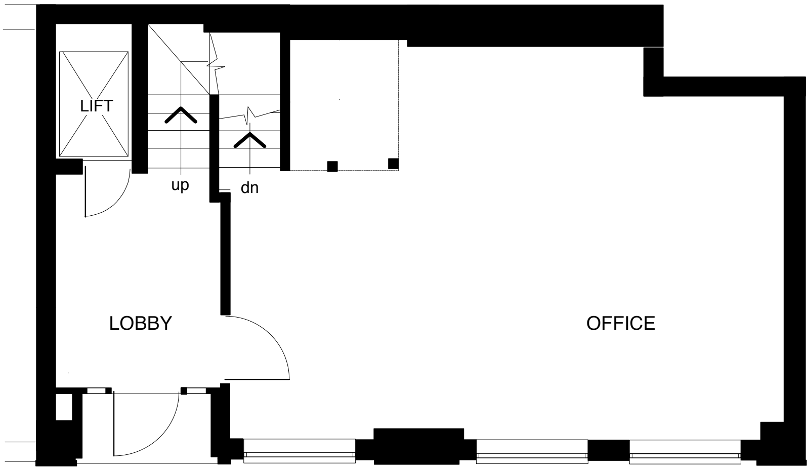
EXISTING GROUND FLOOR PLAN scale 1:50