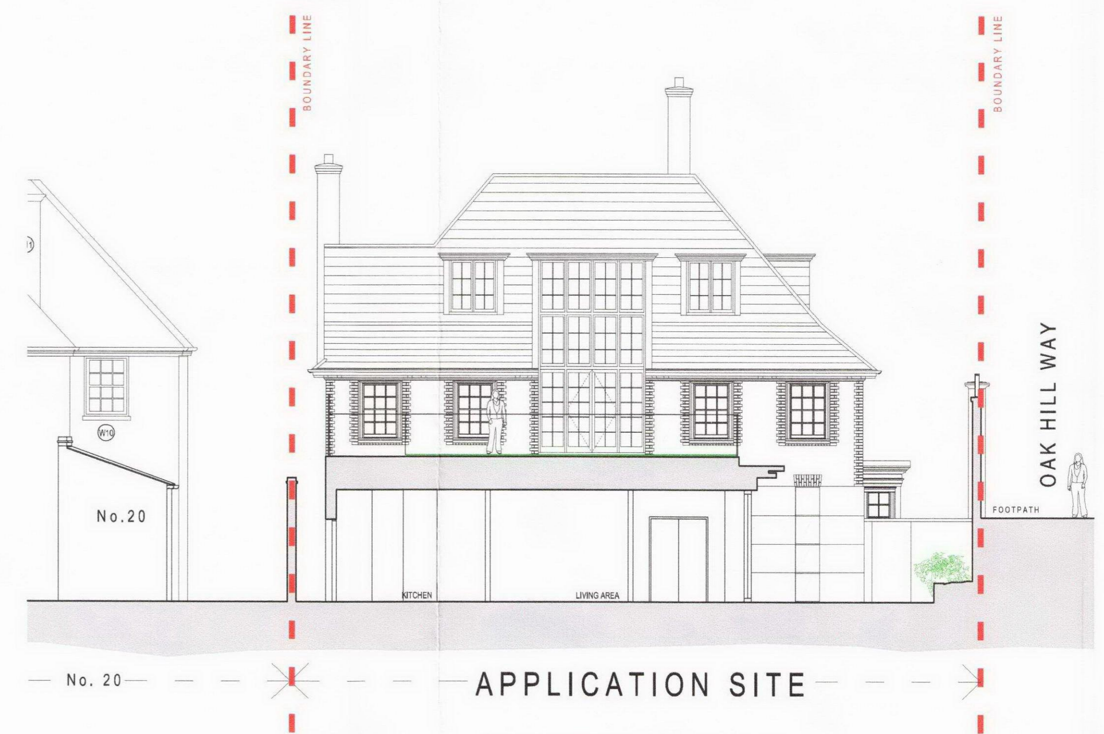
APPLICATION SITE SECTIONAL ELEVATION BB