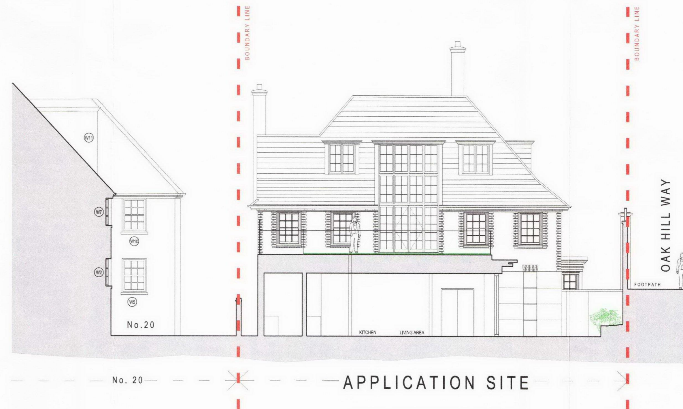
APPLICATION SITE SECTIONAL ELEVATION DD