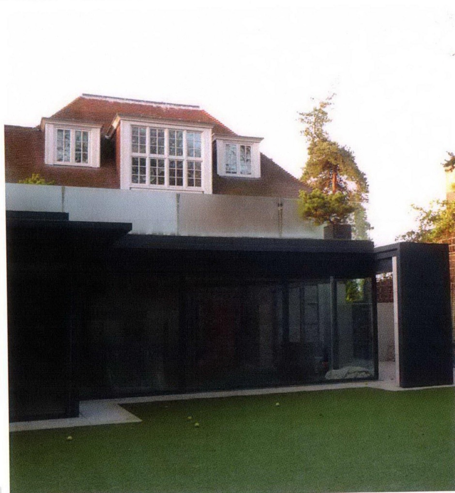
REAR ELEVATION ( REAR GARDEN)