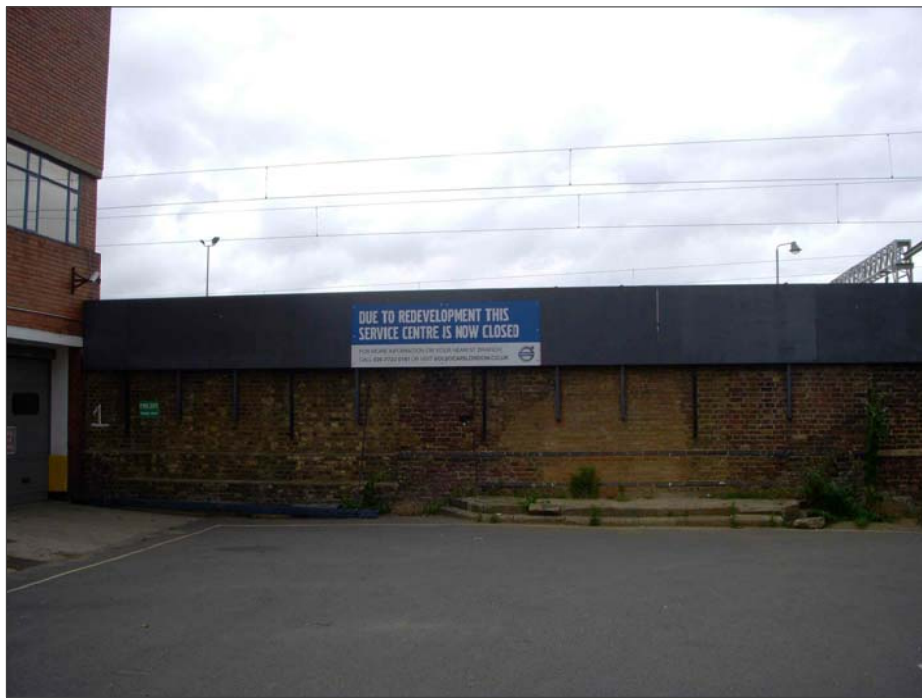
VIEW OF DUMPTON PLACE EXISTING WALL