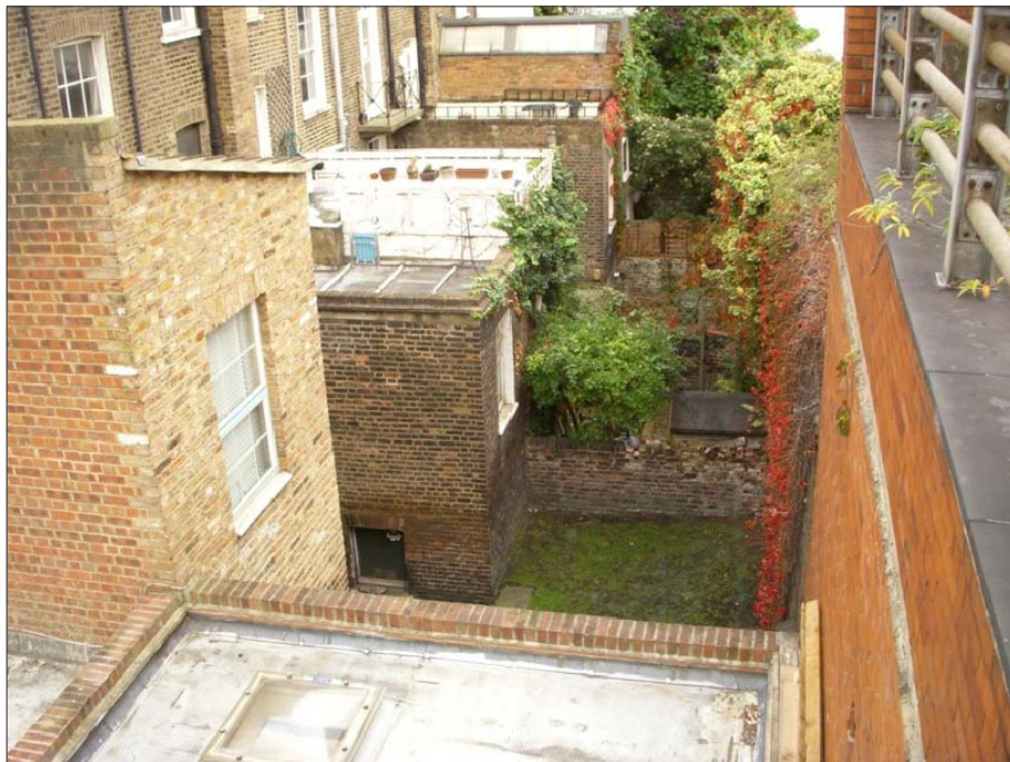
GLOUCESTER AVENUE REAR GARDEN VIEW 01