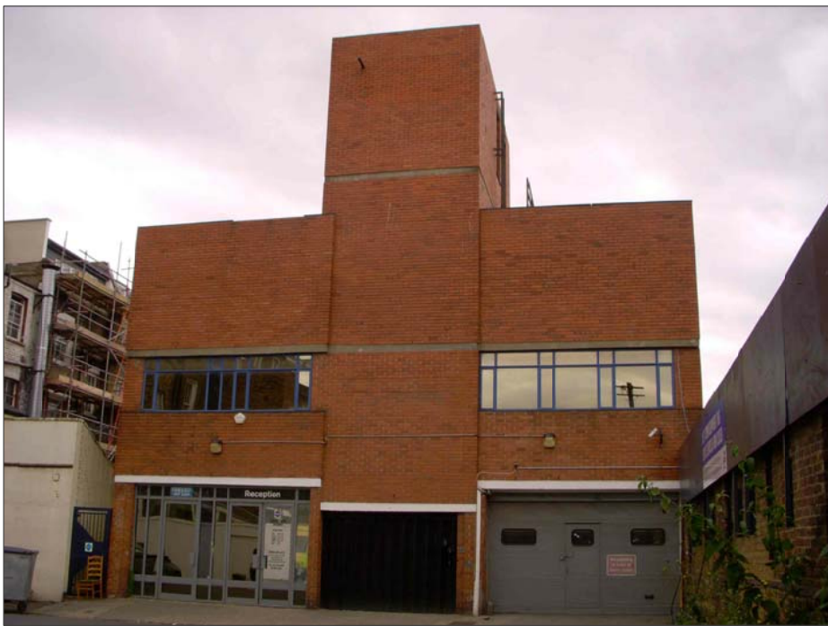
VIEW OF 01 DUMPTON PLACE STREET ELEVATION