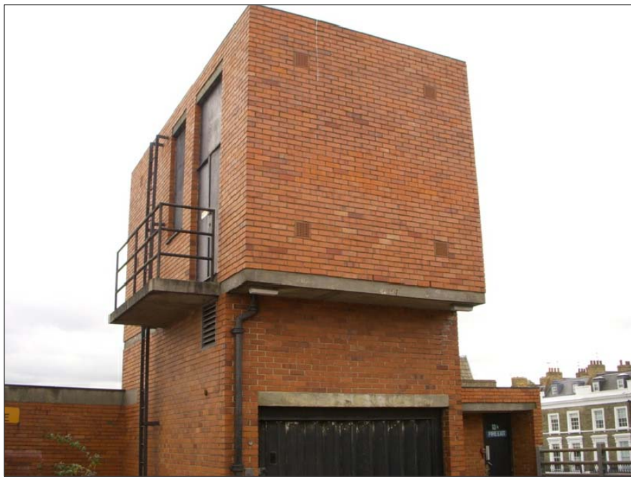
VIEW OF 01 DUMPTON PLACE ROOF LEVEL