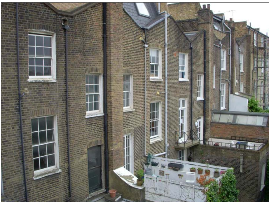
GLOUCESTER AVENUE REAR GARDEN VIEW 04