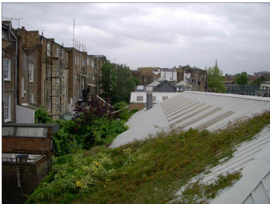
VIEW OF 01 DUMPTON EXISTING WAREHOUSE ROOF 01