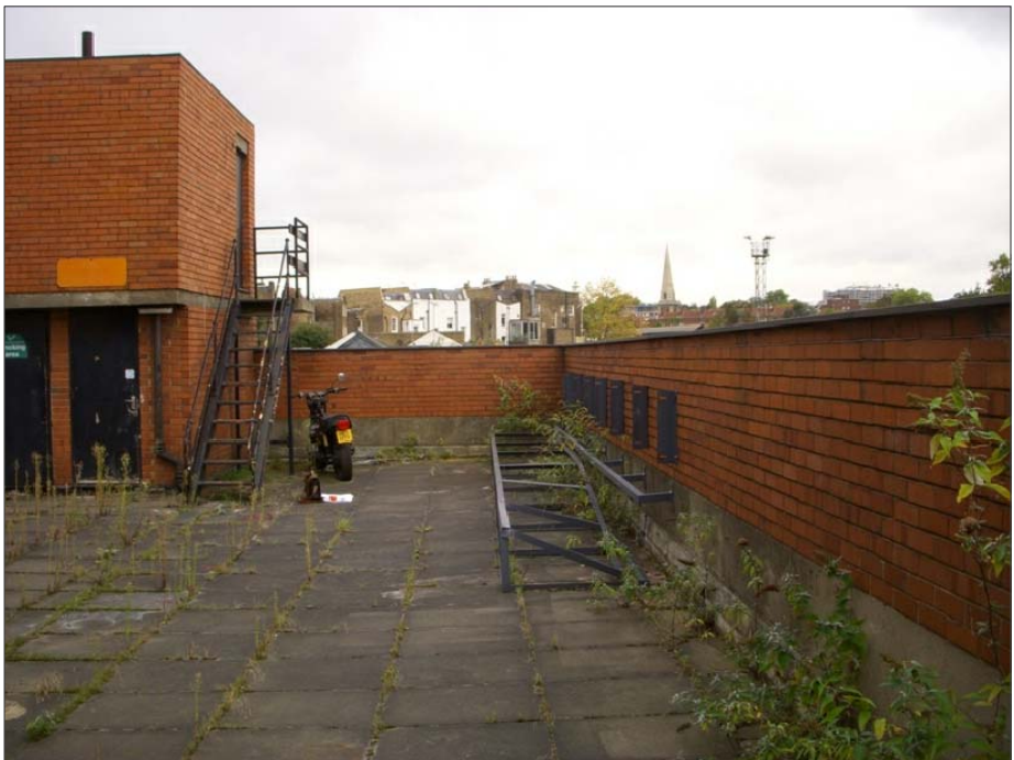
01 DUMPTON EXISTING ROOF LEVEL 02