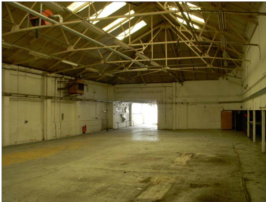
EXISTING 01 DUMPTON PLACE INTERNAL VIEW 03