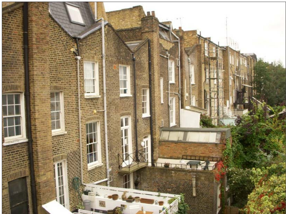
GLOUCESTER AVENUE REAR GARDEN VIEW 02