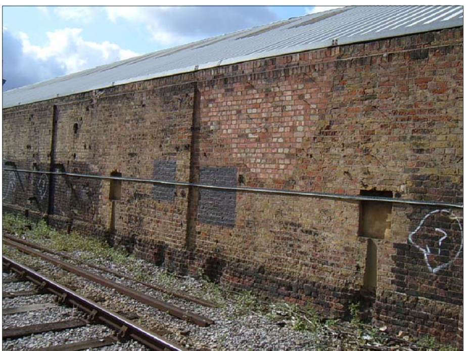
VIEW OF 01 DUMPTON PLACE FROM RAILWAY SIDINGS 01