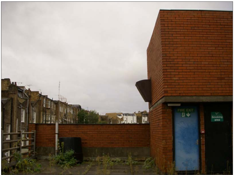
01 DUMPTON EXISTING ROOF LEVEL 01