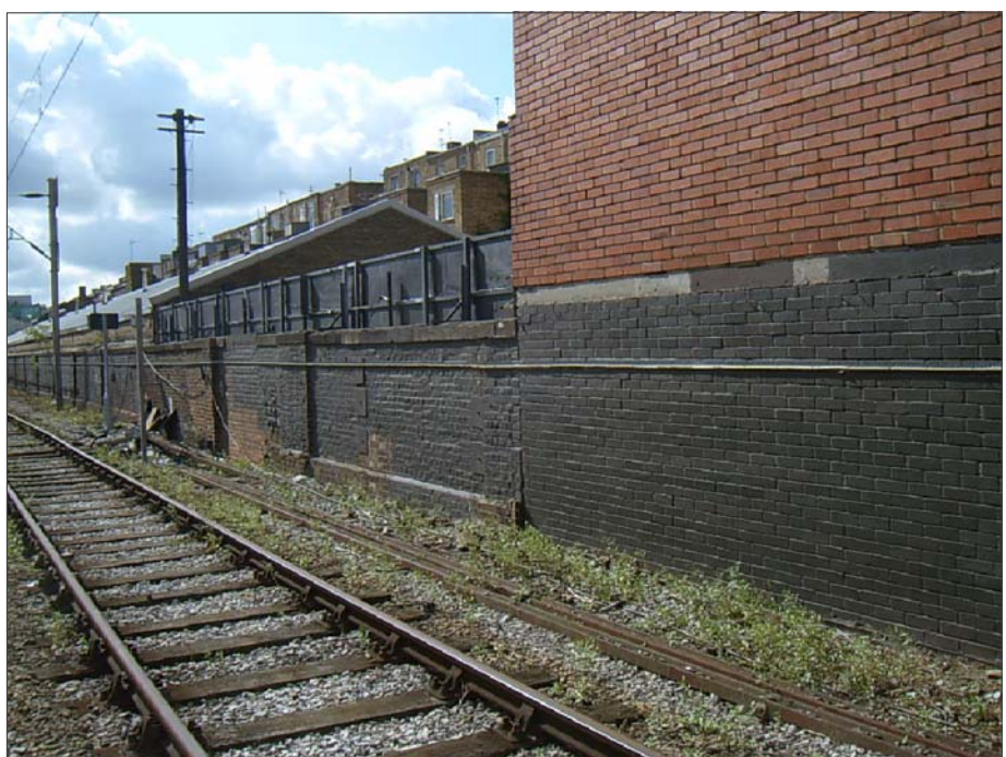
VIEW OF 01 DUMPTON PLACE FROM RAILWAY SIDINGS 04