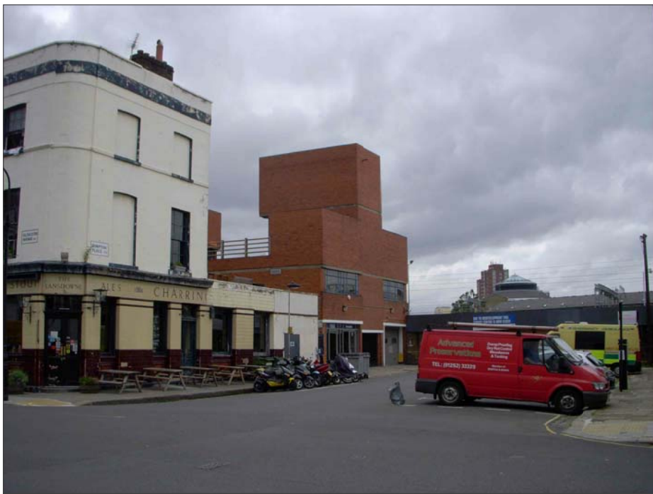
VIEW OF 01 DUMPTON PLACE FROM GLOUCESTER AVENUE