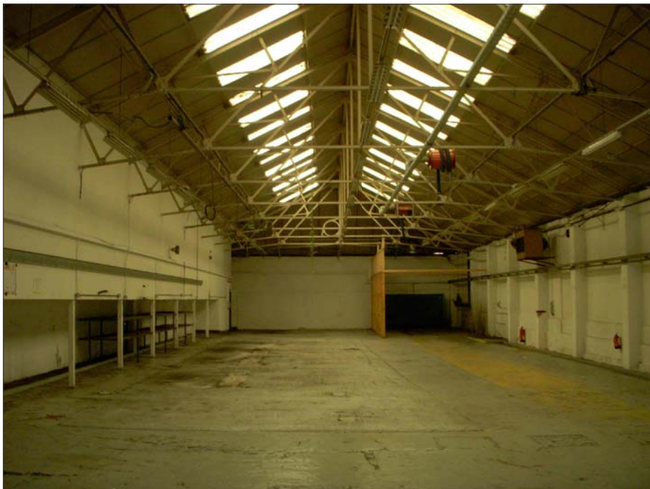
EXISTING 01 DUMPTON PLACE INTERNAL VIEW 01