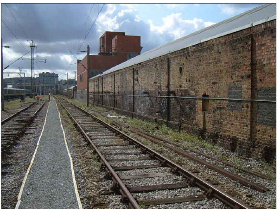
VIEW OF 01 DUMPTON PLACE FROM RAILWAY SIDINGS 02