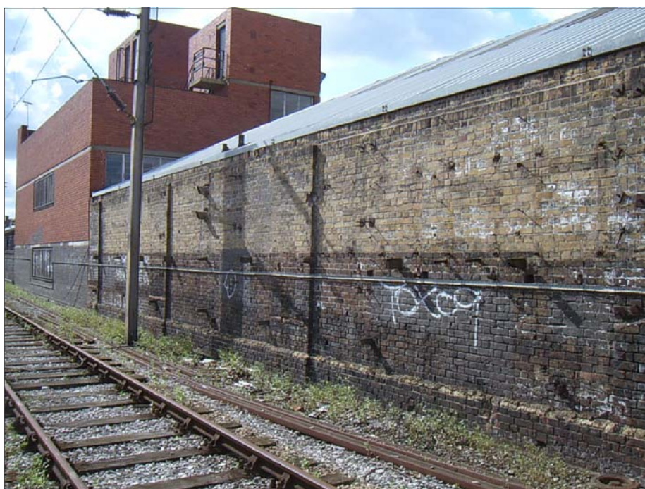
VIEW OF 01 DUMPTON PLACE FROM RAILWAY SIDINGS 03