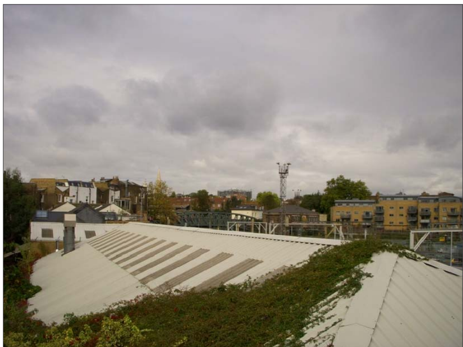
VIEW OF 01 DUMPTON EXISTING WAREHOUSE ROOF 02