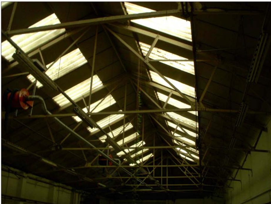
EXISTING 01 DUMPTON PLACE INTERNAL VIEW 02