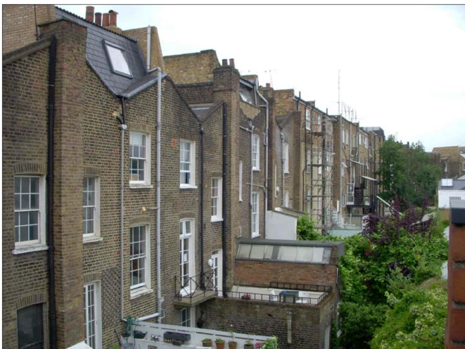
GLOUCESTER AVENUE REAR GARDEN VIEW 03