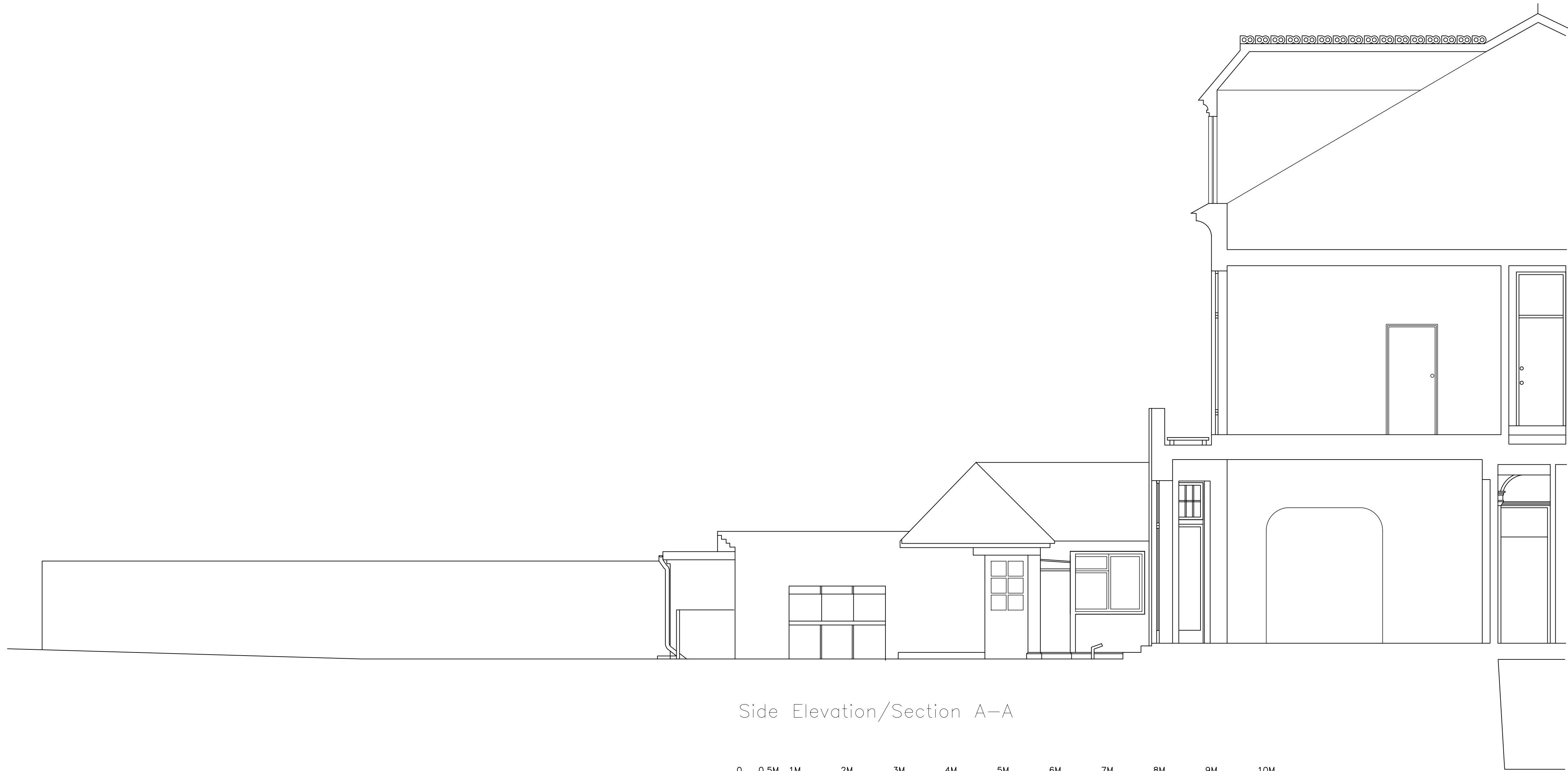
Side Elevation/Section A-A