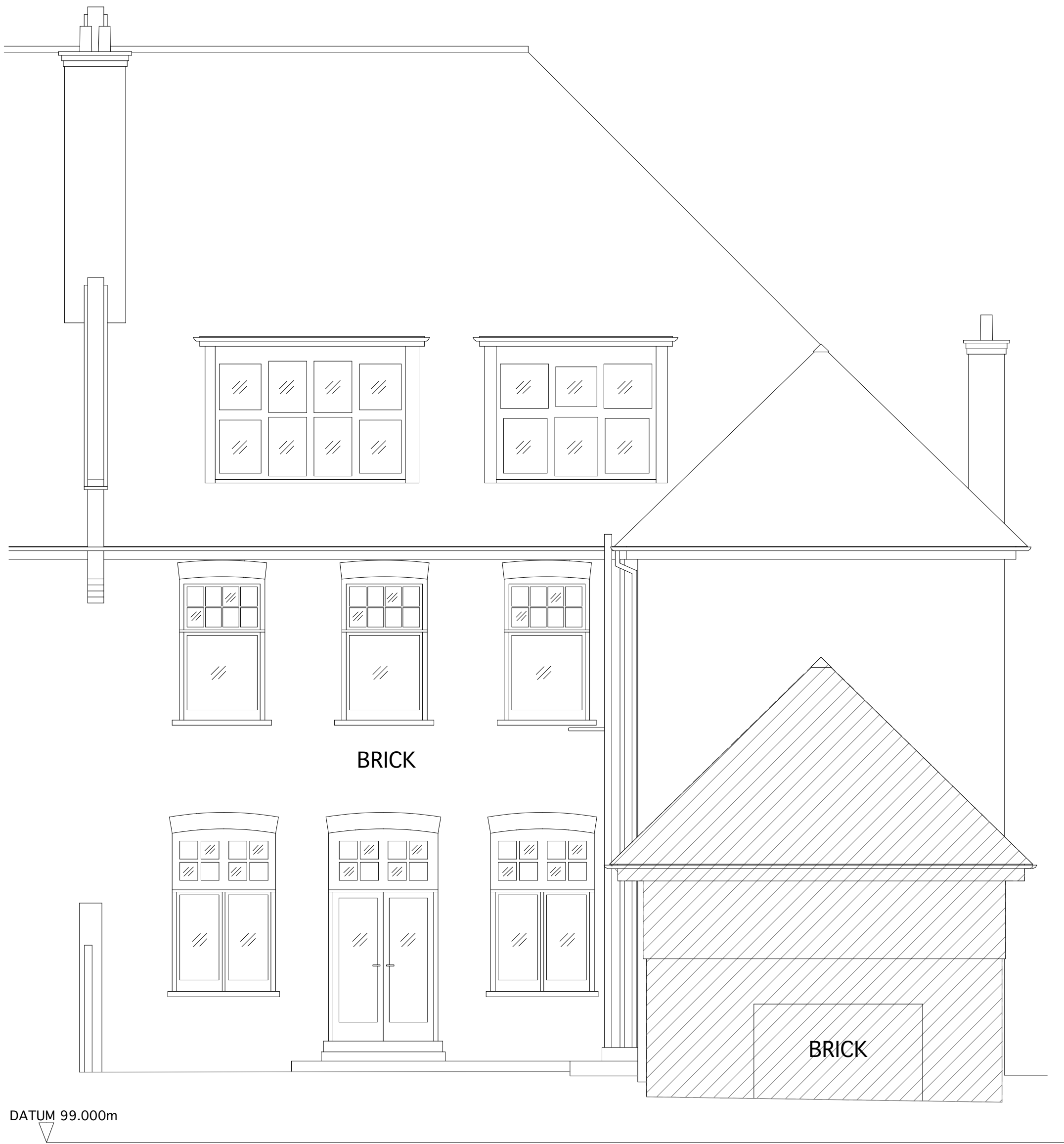
Existing Condition: Rear Elevation

All dimensions to be verified on site To be read in conjunction with all relevant documents In the event of discrepancy notify the Architect immediately This document is copyright of Hugh Cullum Architects Ltd