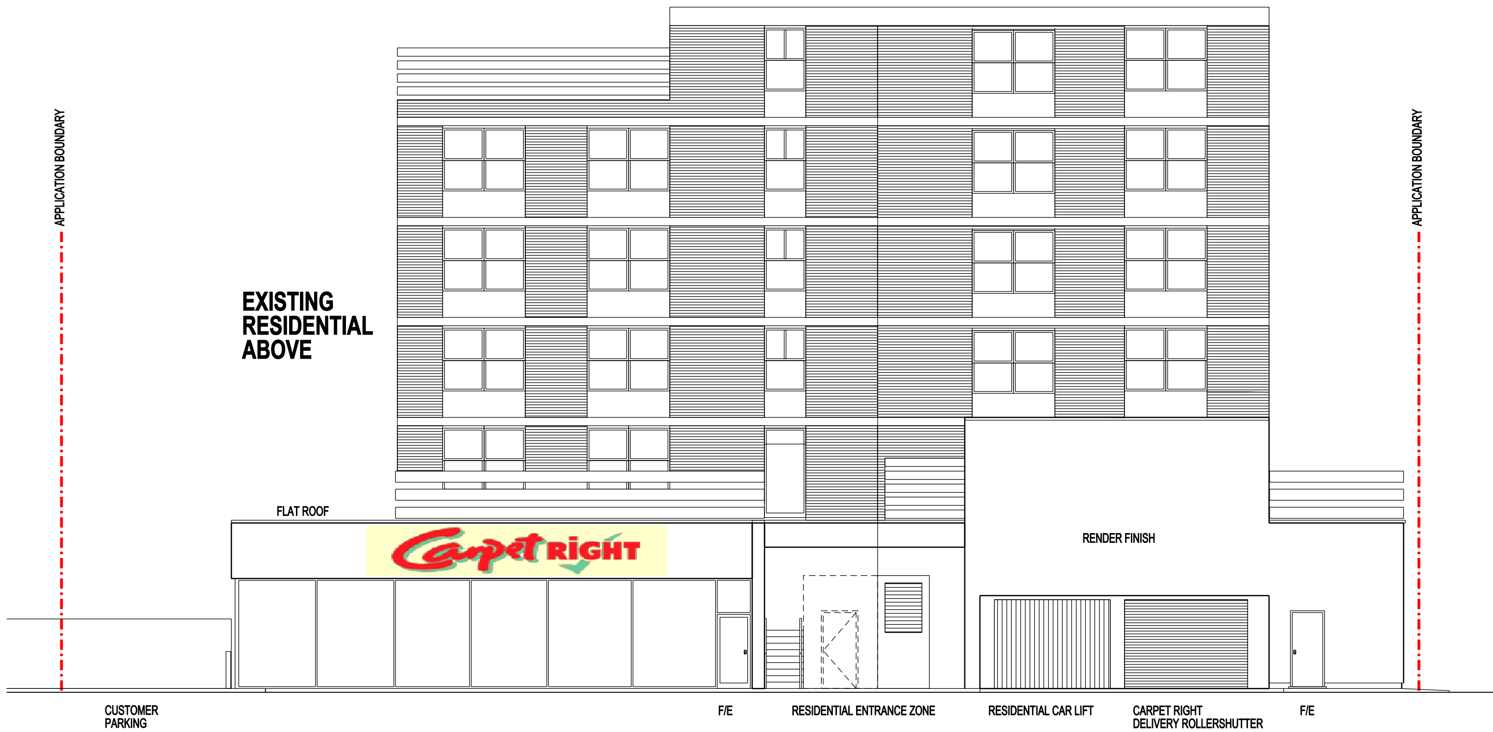
SIDE ELEVATION - ROCHESTER ROAD