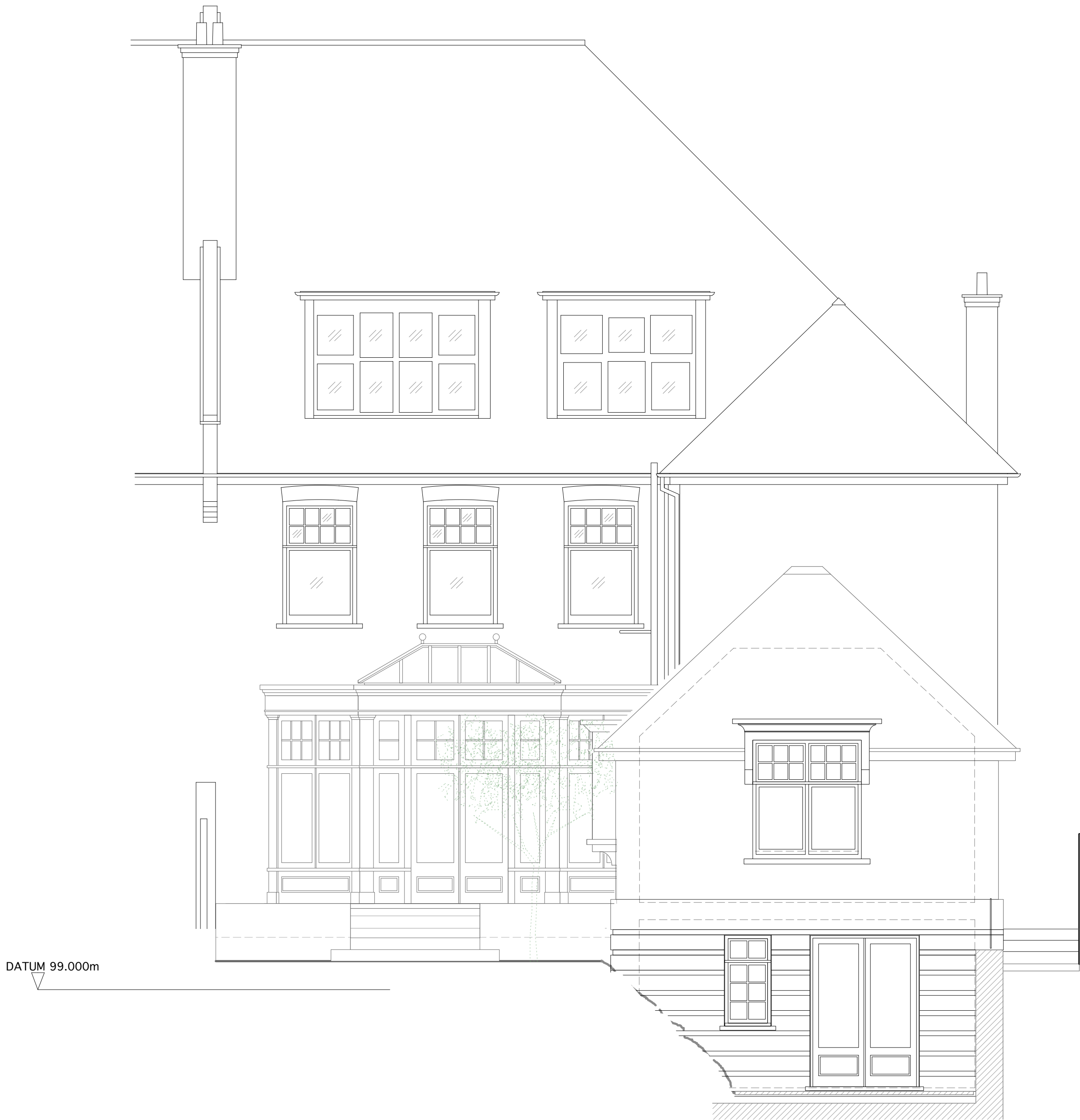
Proposed: Rear Elevation

All dimensions to be verified on site To be read in conjunction with all relevant documents In the event of discrepancy notify the Architect immediately This document is copyright of Hugh Cullum Architects Ltd