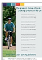
Falco Cycle Parking