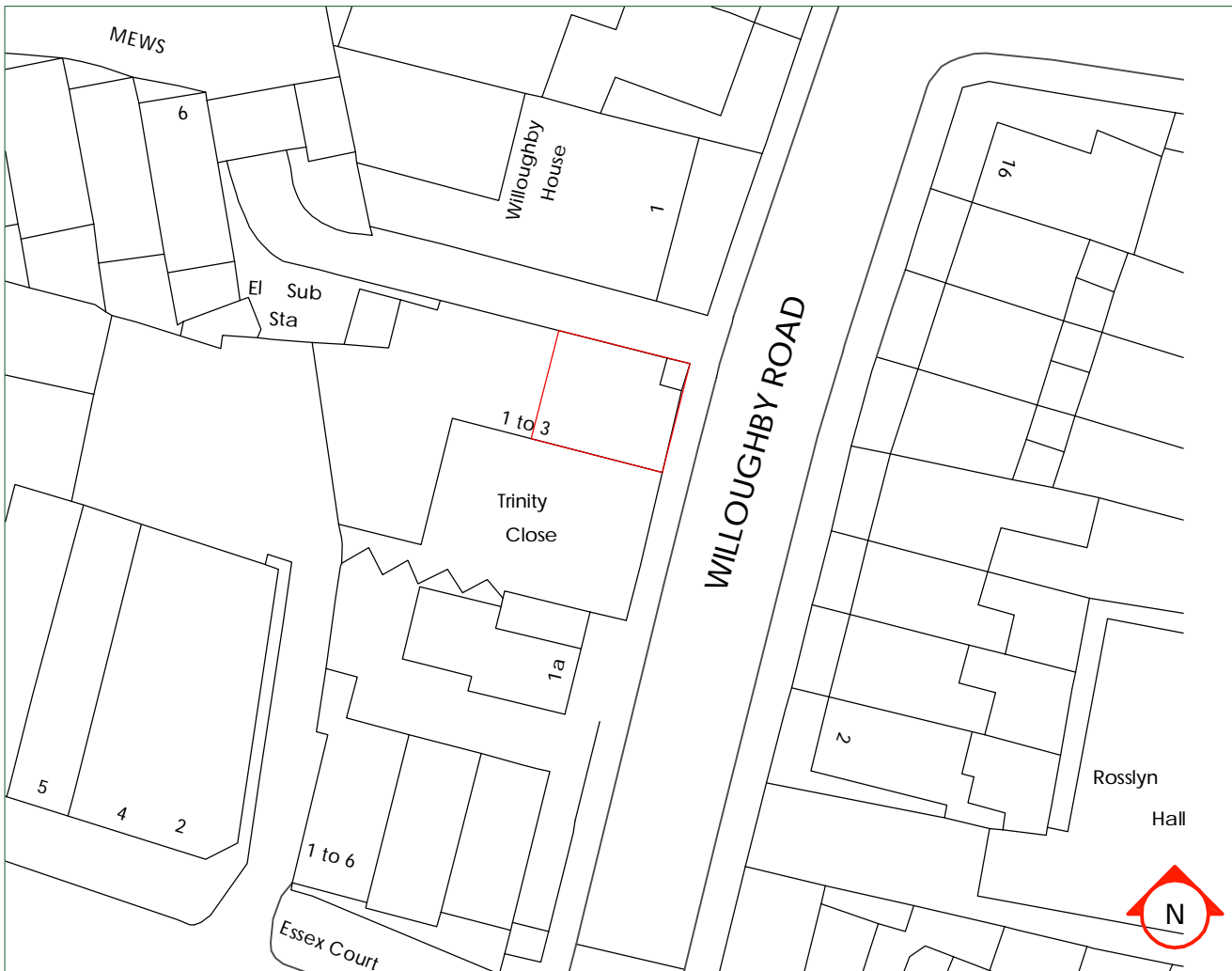
3 TrinityClose Hampstead OS Map 1:1250

COPYRIGHT OF THIS DRAWING IS RETAINED BY BUILDING DOCTORS LTD. / DO NOT SCALE FROM THIS DRAWING - ONLY USE DIMENSIONS SHOWN. / TO BE READ IN CONJUNCTION WITH ALL RELATED ARCHITECT/ENGINEER DRAWINGS/DETAILS & OTHER RELEVANT TENDER INFORMATION / ANY DISCREPANCIES BETWEEN THIS DRAWING AND ANY OTHER INFORMATION SHOULD BE REPORTED TO THE PROJECT ARCHITECT. / CONTRACTORS ARE TO VERIFY ALL SITE DIMENSIONS BEFORE MANUFACTURE.