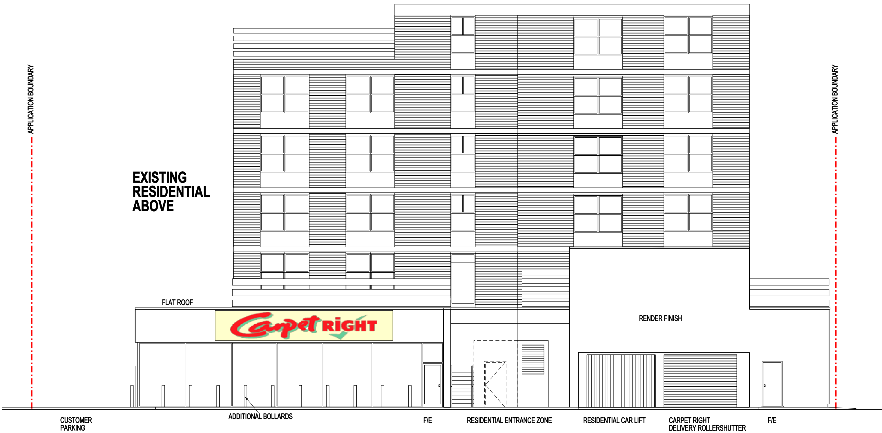
SIDE ELEVATION - ROCHESTER ROAD