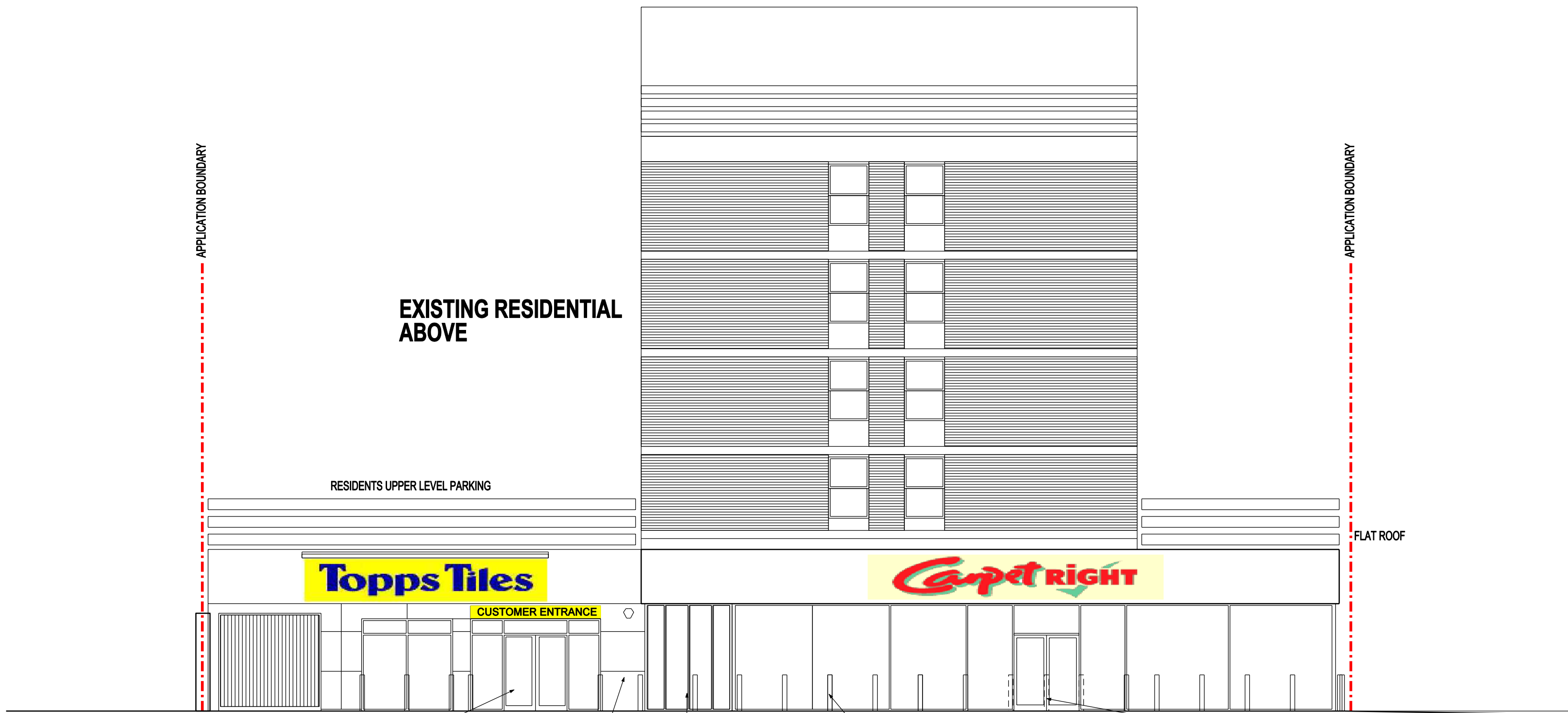
FRONT ELEVATION - CAMDEN ROAD