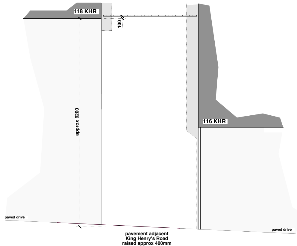
Fence 2 (116-118 KHR)