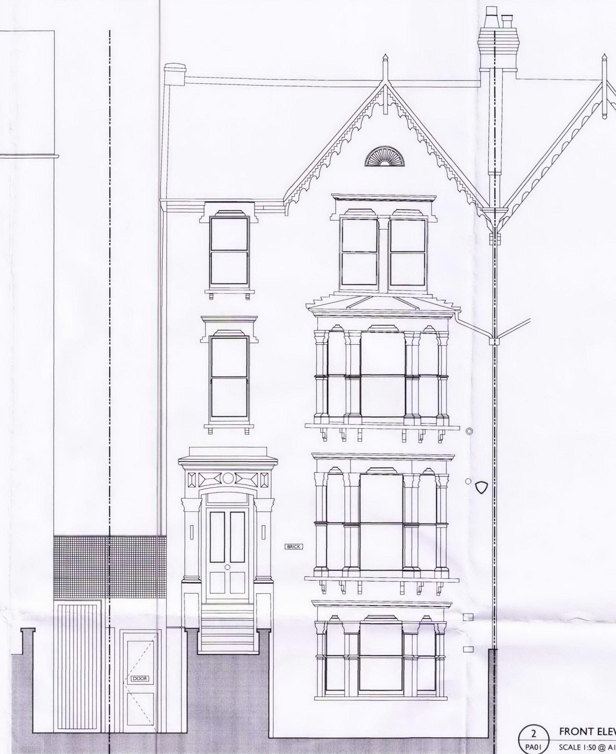
2 FRONT ELEVATION PA01 SCALE 1:50 @ A1