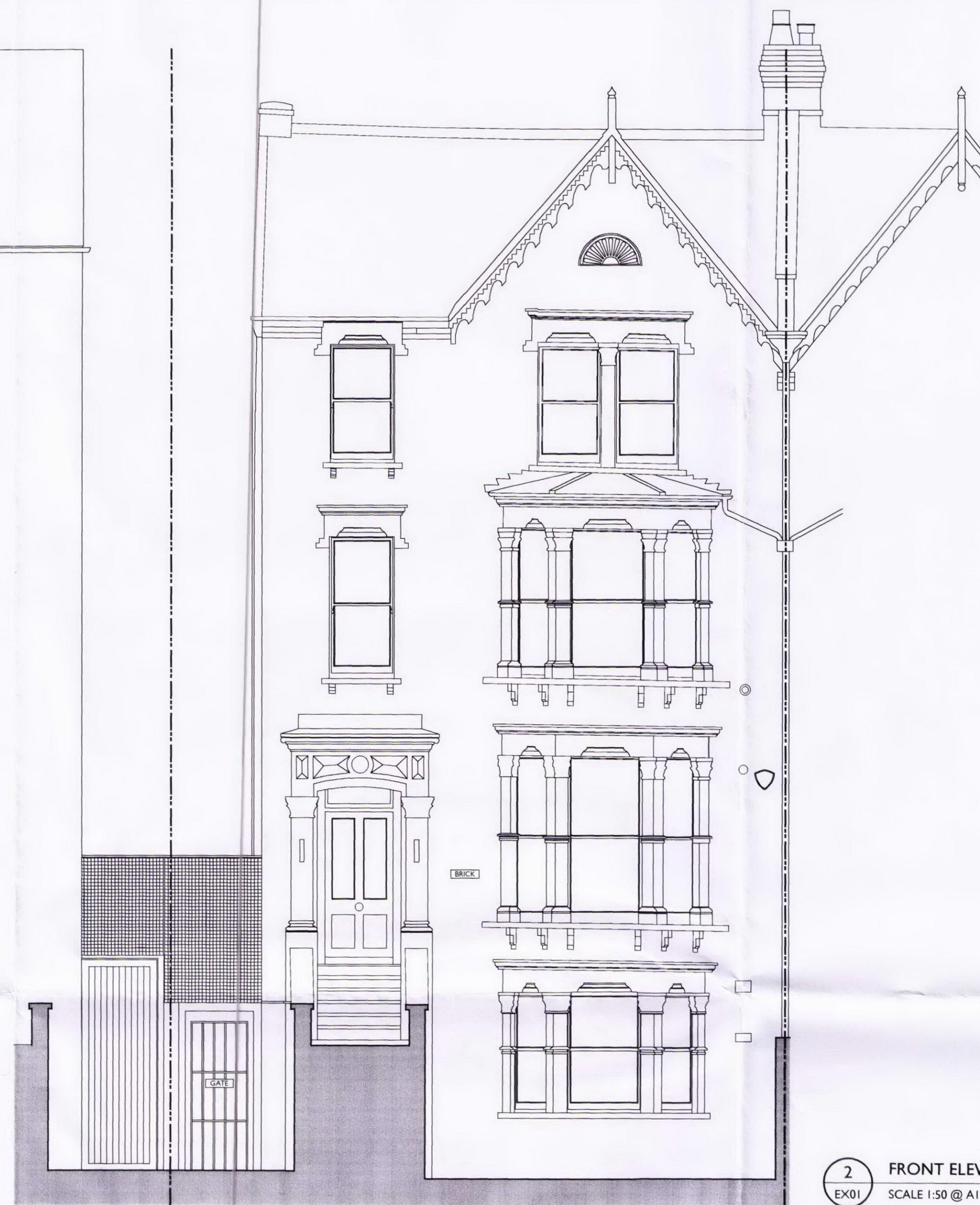
2 FRONT ELEVATION EX01 SCALE 1:50 @ A1