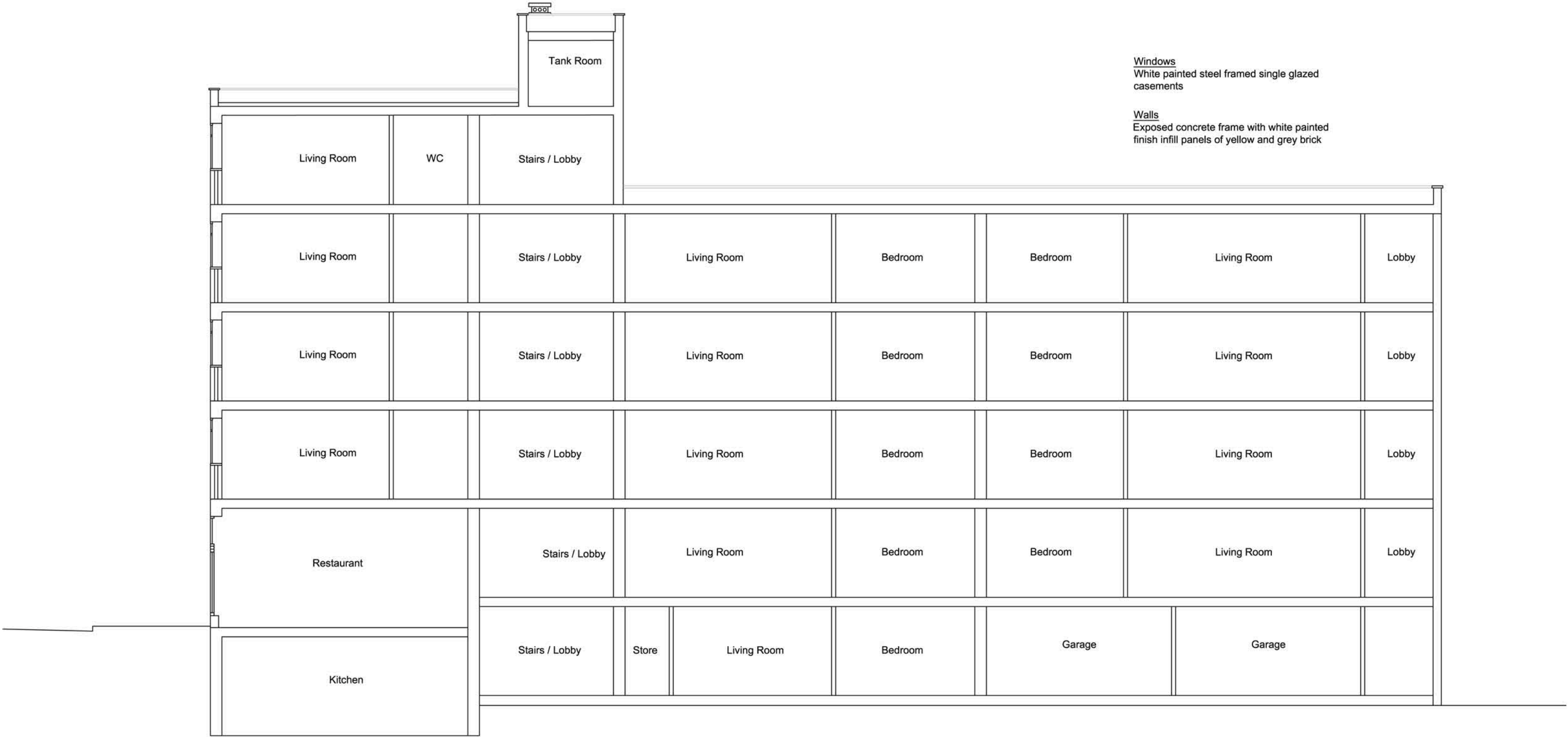
Section C-C (Existing)