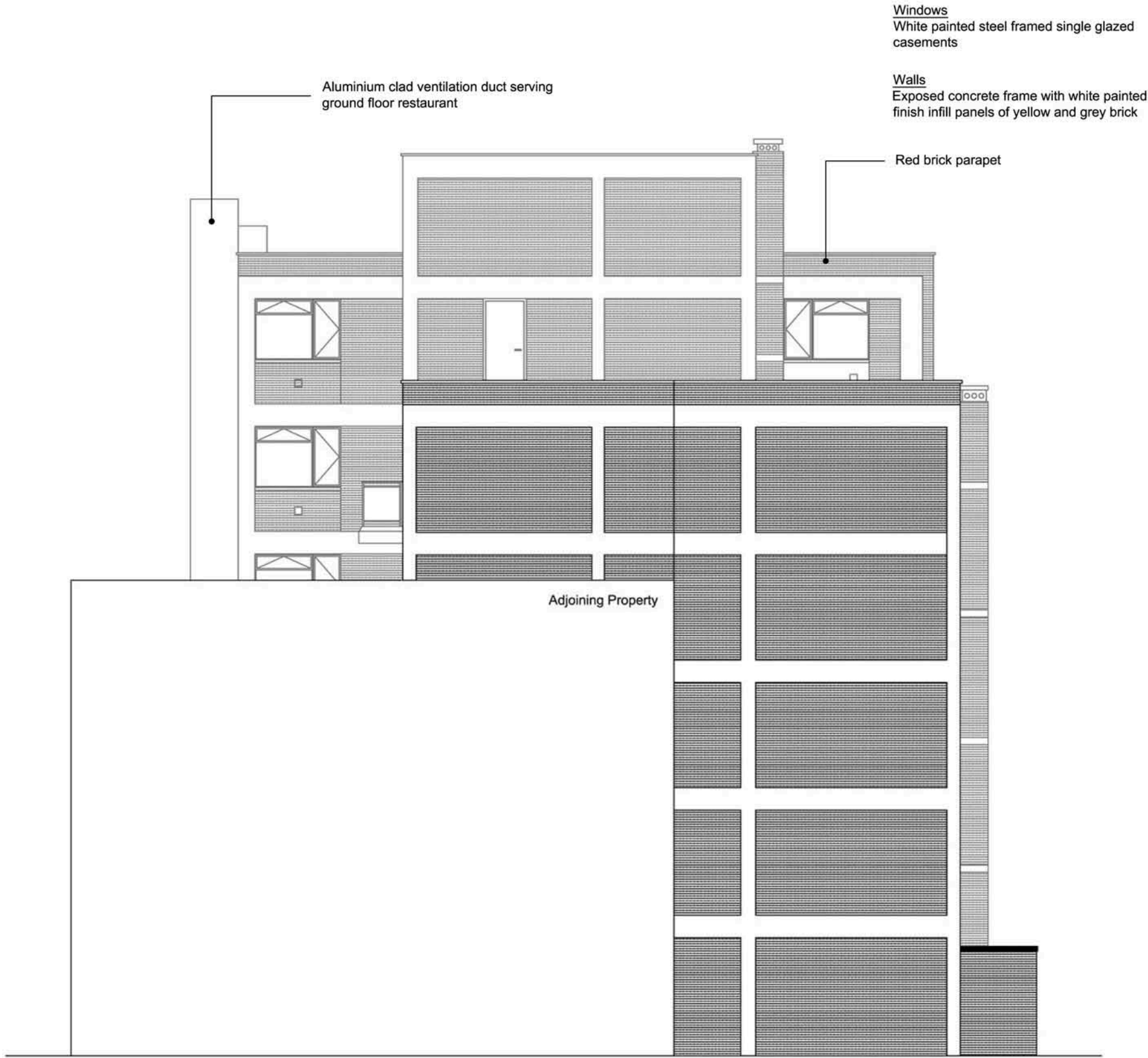
East Elevation (Existing)