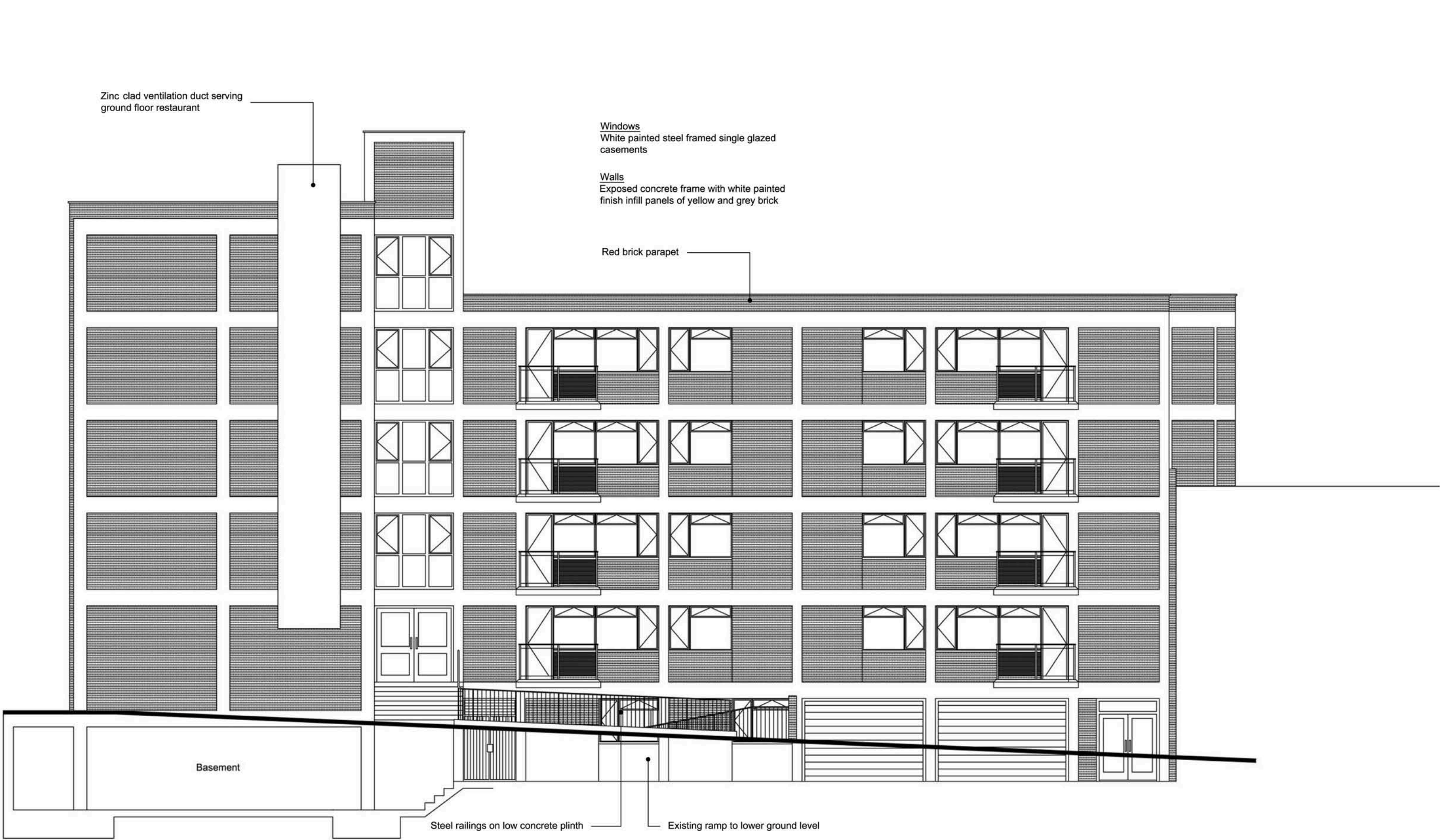
South Elevation (Existing)