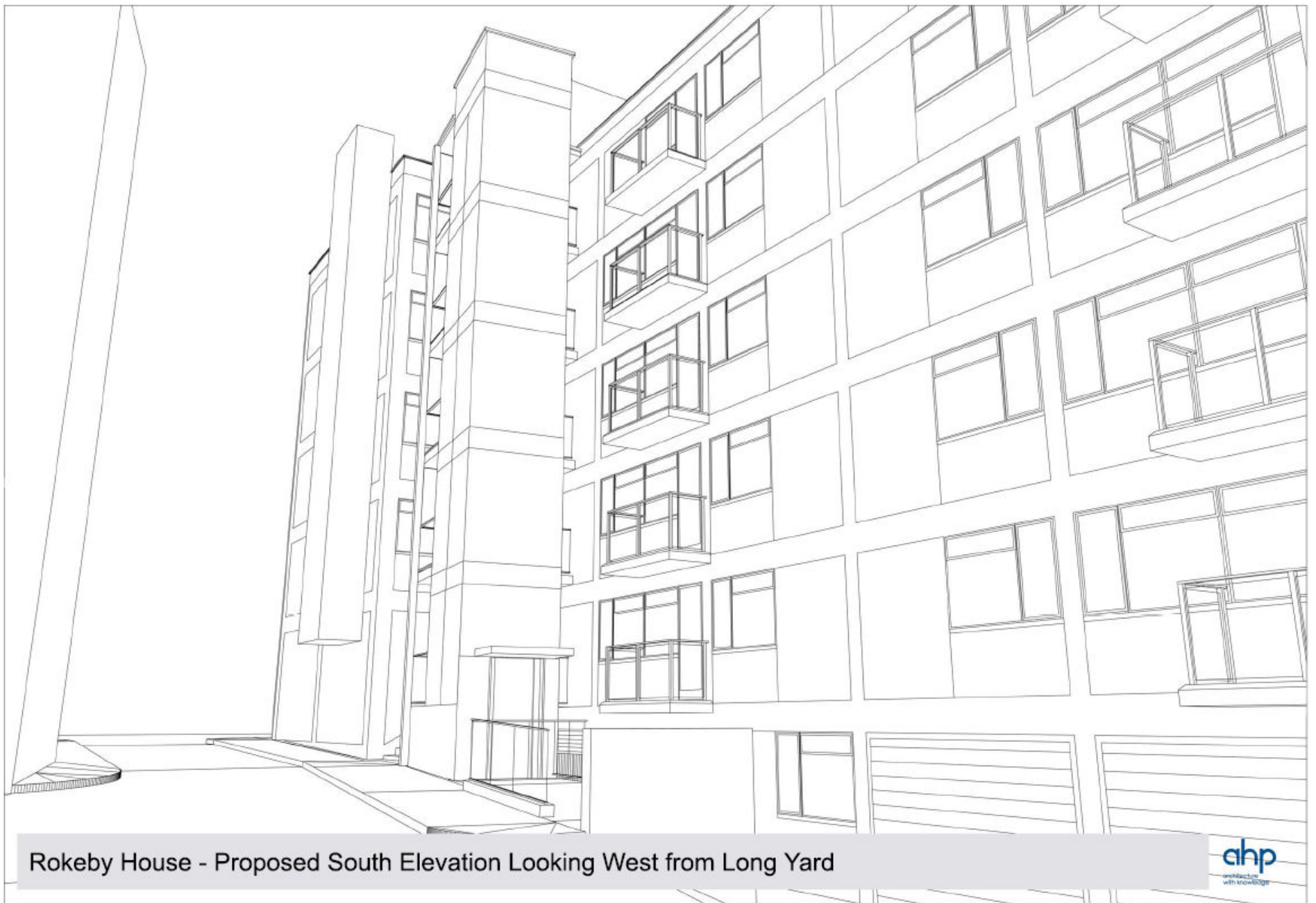
Rokeby House - Proposed South Elevation Looking West from Long Yard