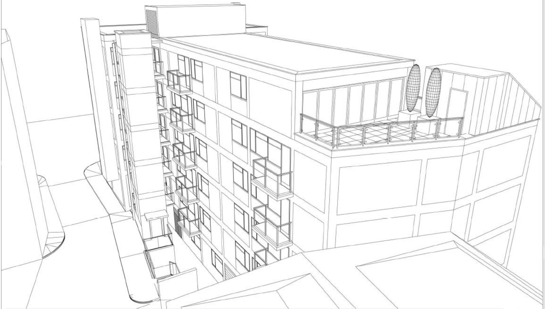
Rokeby House - Proposed Aerial View Looking West