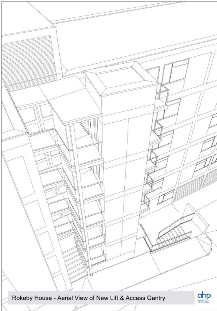
Rokeby House - Aerial View of New Lift & Access Gantry