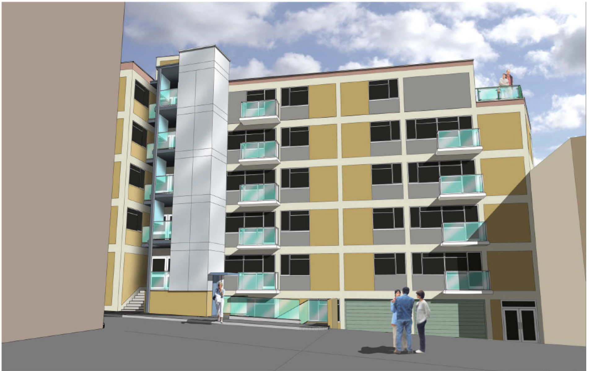
Rokeby House - Proposed South Elevation Viewed From Rear of Spens House