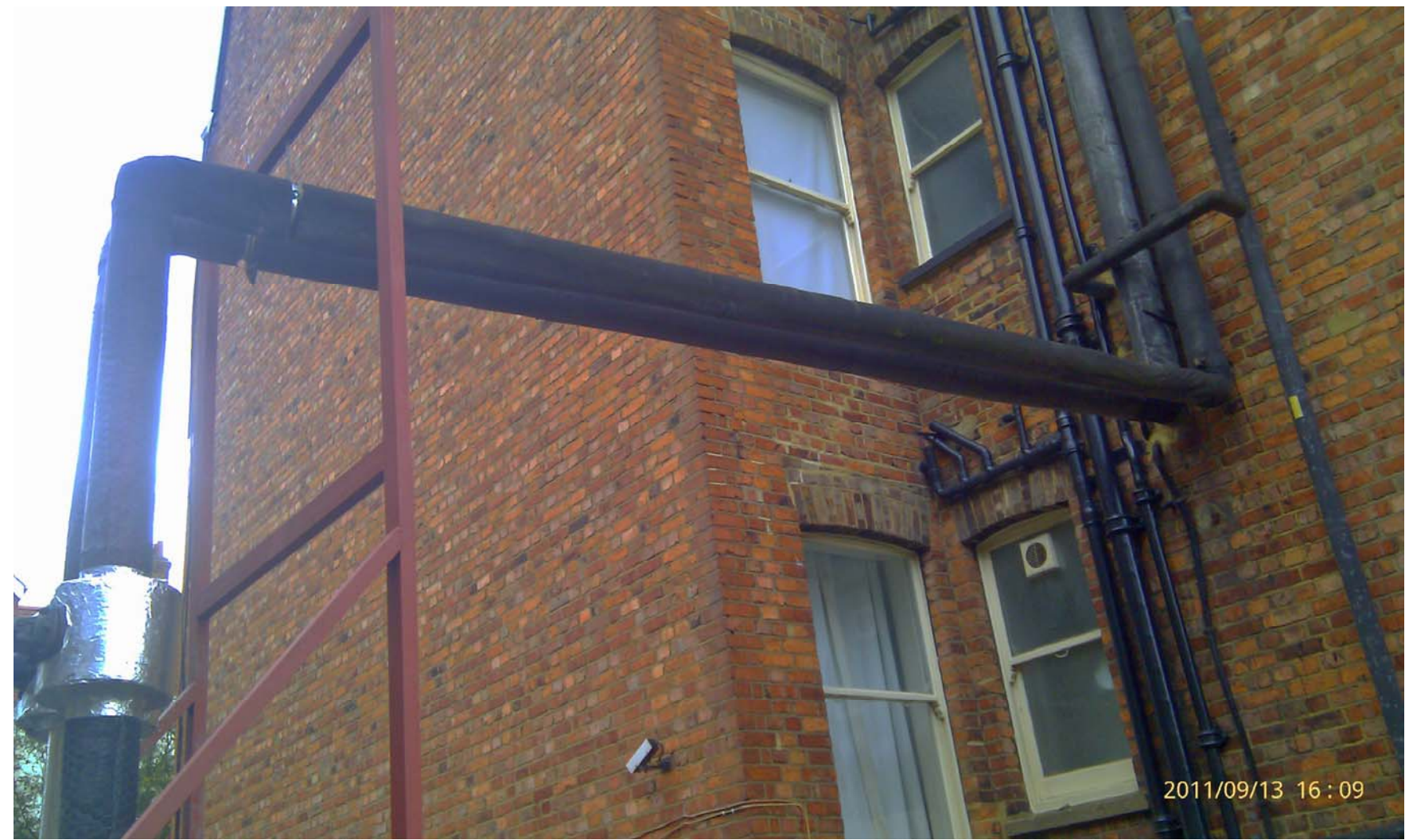
Existing HWS Pipework from Boilerhouse to North Wall