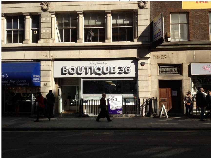
View to front of property (note signboard to front of railing)