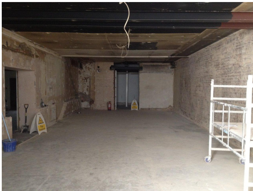
Internal view of property