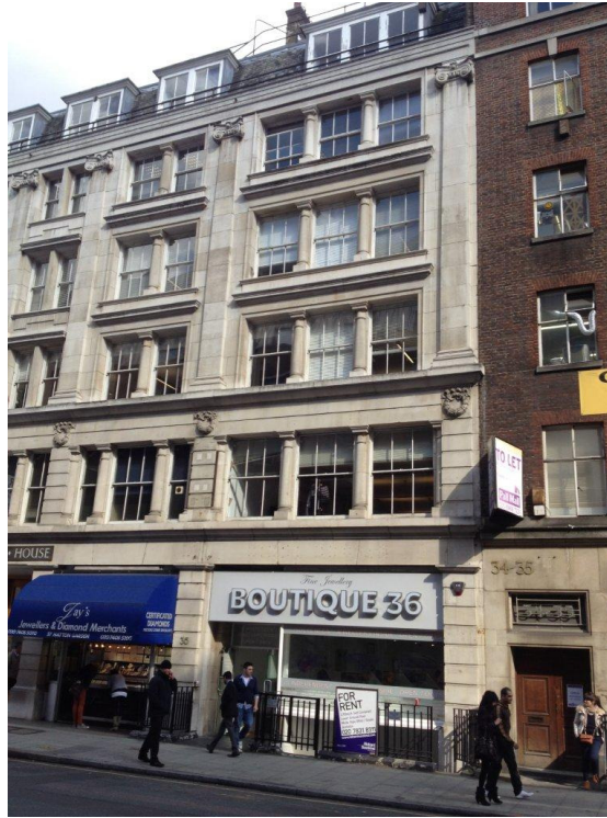
View to front of property