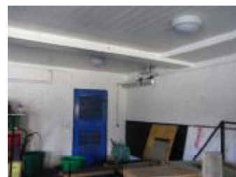
photographs of existing undercroft