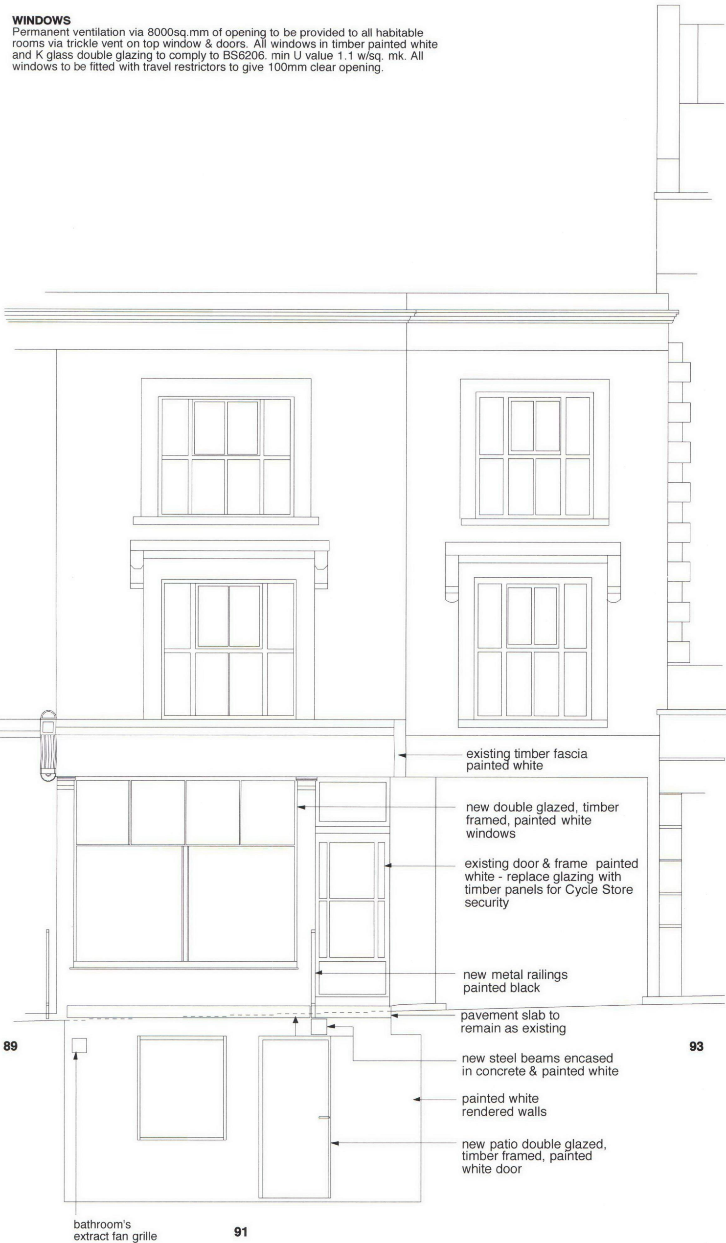
SECTIONAL FRONT ELEVATION

WINDOWS Permanent ventilation via 8000sq.mm of opening to be provided to all habitable rooms via trickle vent on top window & doors. All windows in timber painted white and K glass double glazing to comply to BS6206. min U value 1.1 w/sq. mk. All windows to be fitted with travel restrictors to give 100mm clear opening.