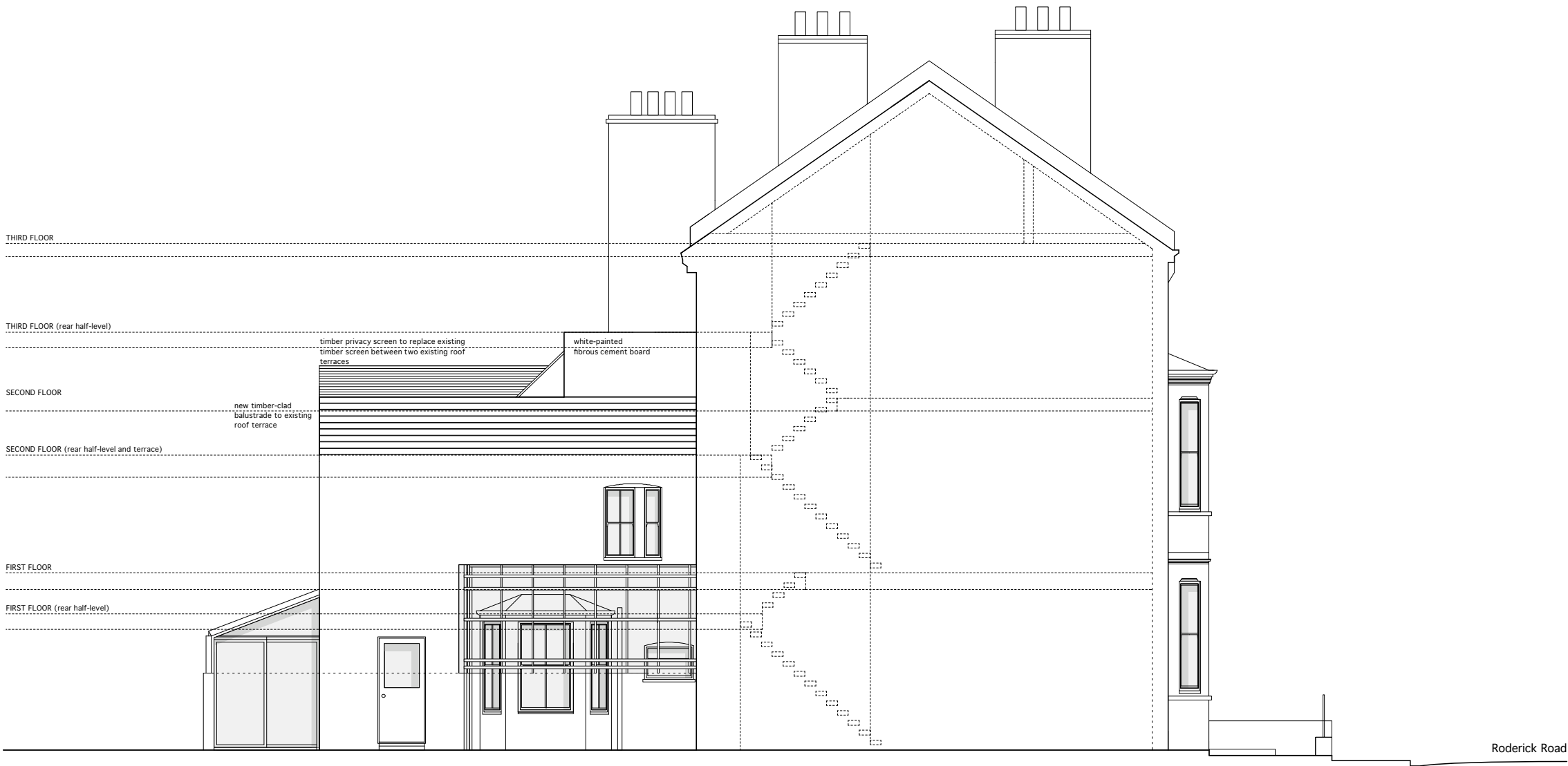
SIDE (south) ELEVATION