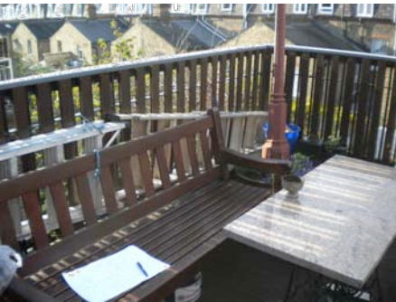
REAR (west) ELEVATION

NB: details of neighbouring properties indicative only - no measured survey undertaken