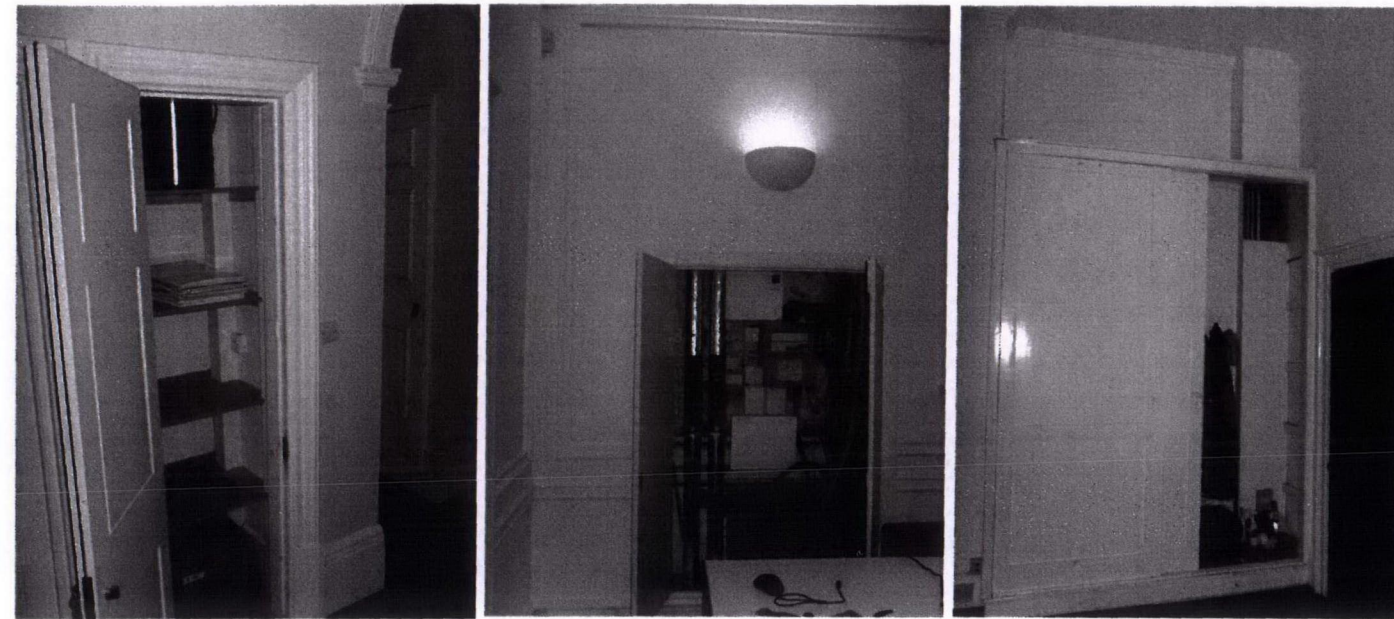
WITHIN EXISTING RISER WITHIN EXISTING RISER WITHIN EXISTING RISER