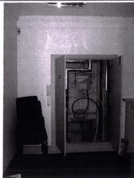
DISTRIBUTION BOARD RETAINED WITHIN EXISTING RISER CUPBOARD