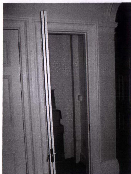
NEW ELECTRICAL SUBMAINS WITHIN EXISTING RISER CUPBOARD