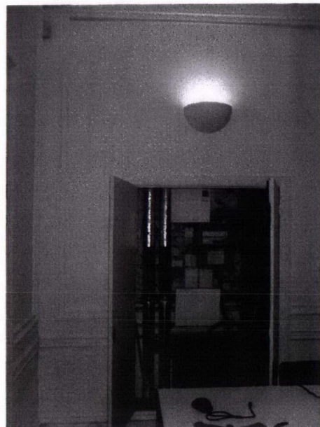
DISTRIBUTION BOARD RETAINED WITHIN EXISTING RISER CUPBOARD