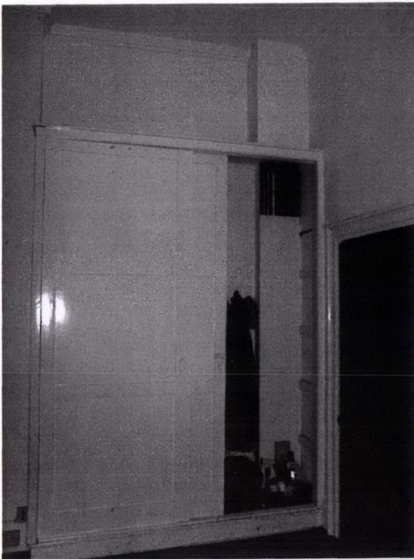
NEW ELECTRICAL SUBMAINS & DISTRIBUTION BOARDS WITHIN EXISTING RISER CUPBOARD