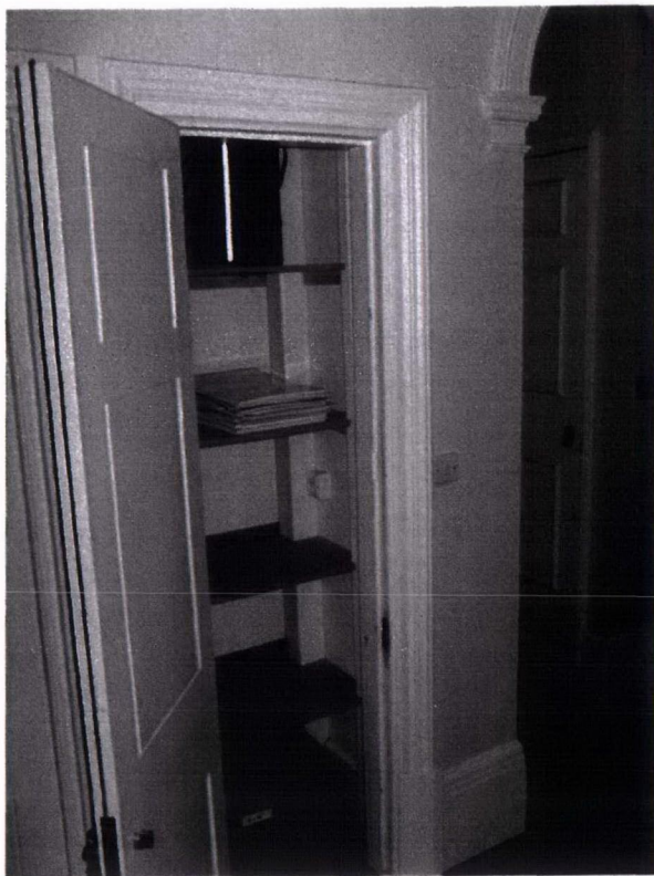
NEW ELECTRICAL SUBMAINS RISE TO ABOVE WITHIN EXISTING RISER CUPBOARD