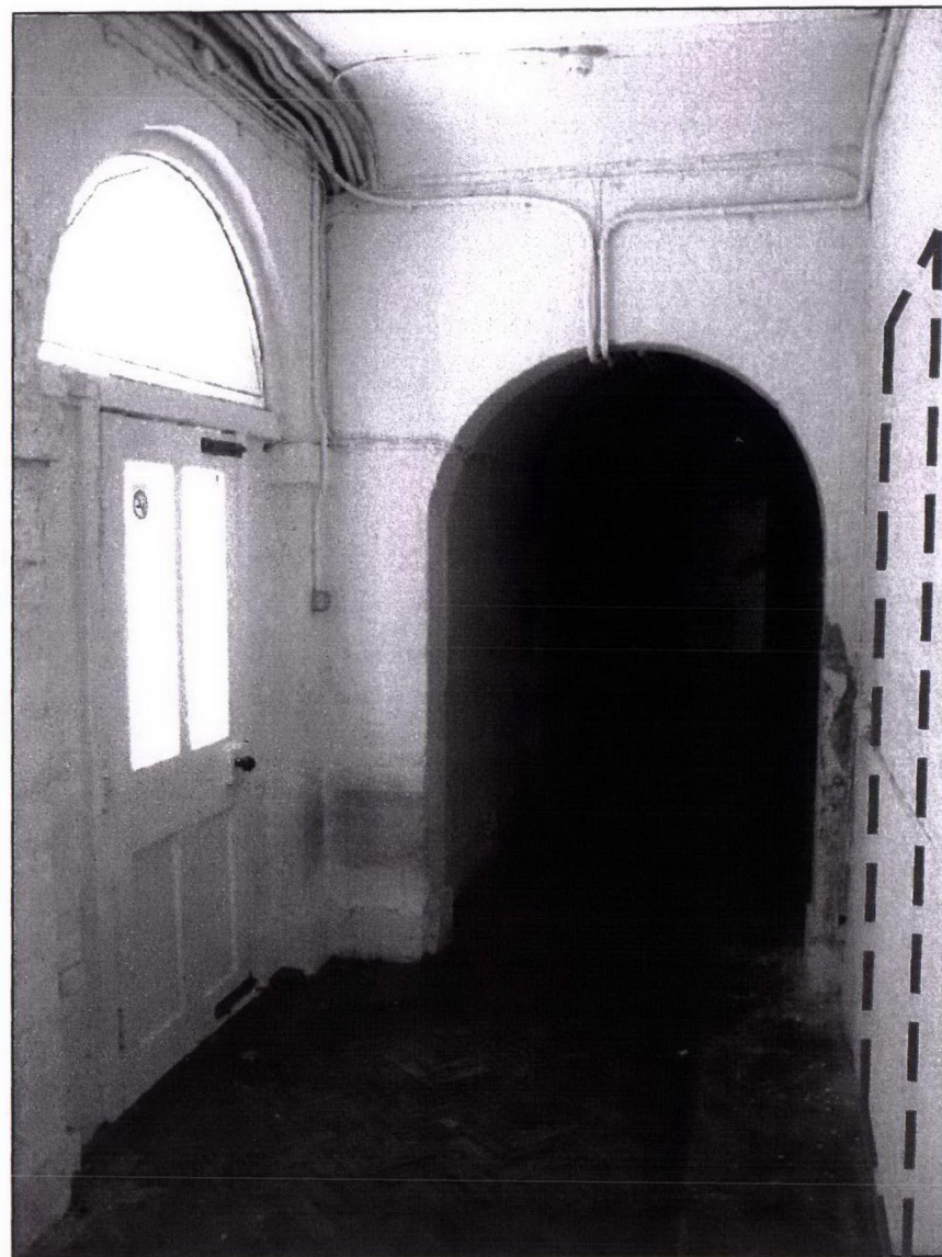
--- Indicative location of lateral connection