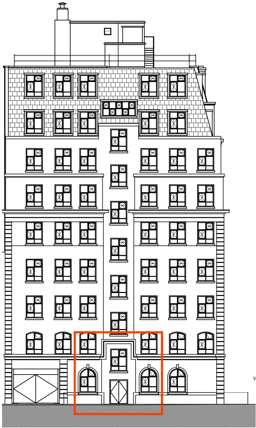
Elevation to Tavistock Place - General Arrangement