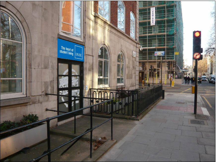
Photomontage - As Proposed