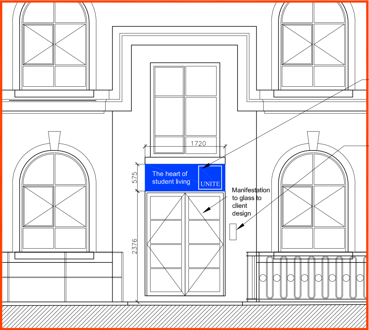
Elevation to Tavistock Place - Detail - As Proposed