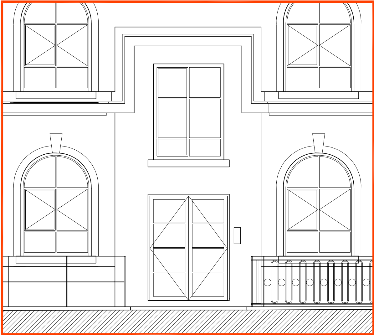
Elevation to Tavistock Place - Detail - As Existing