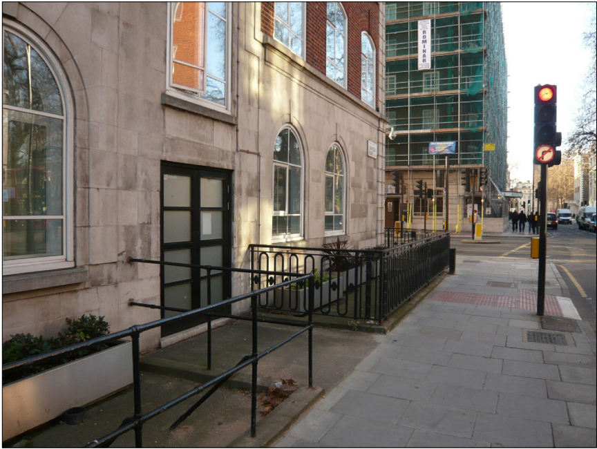
Photograph - As Existing