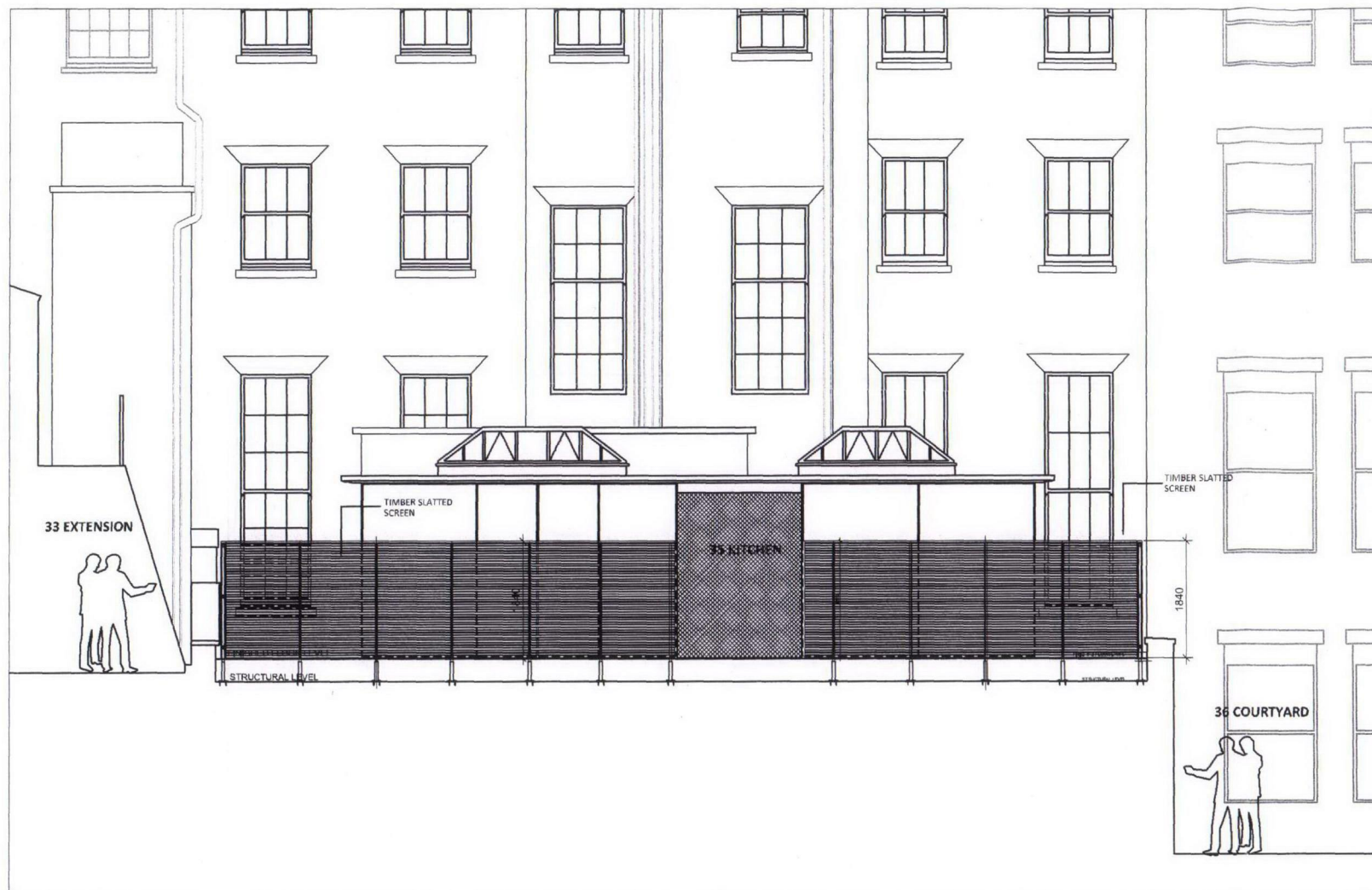
PROPOSED - REAR ELEVATION 1:100 (A3)