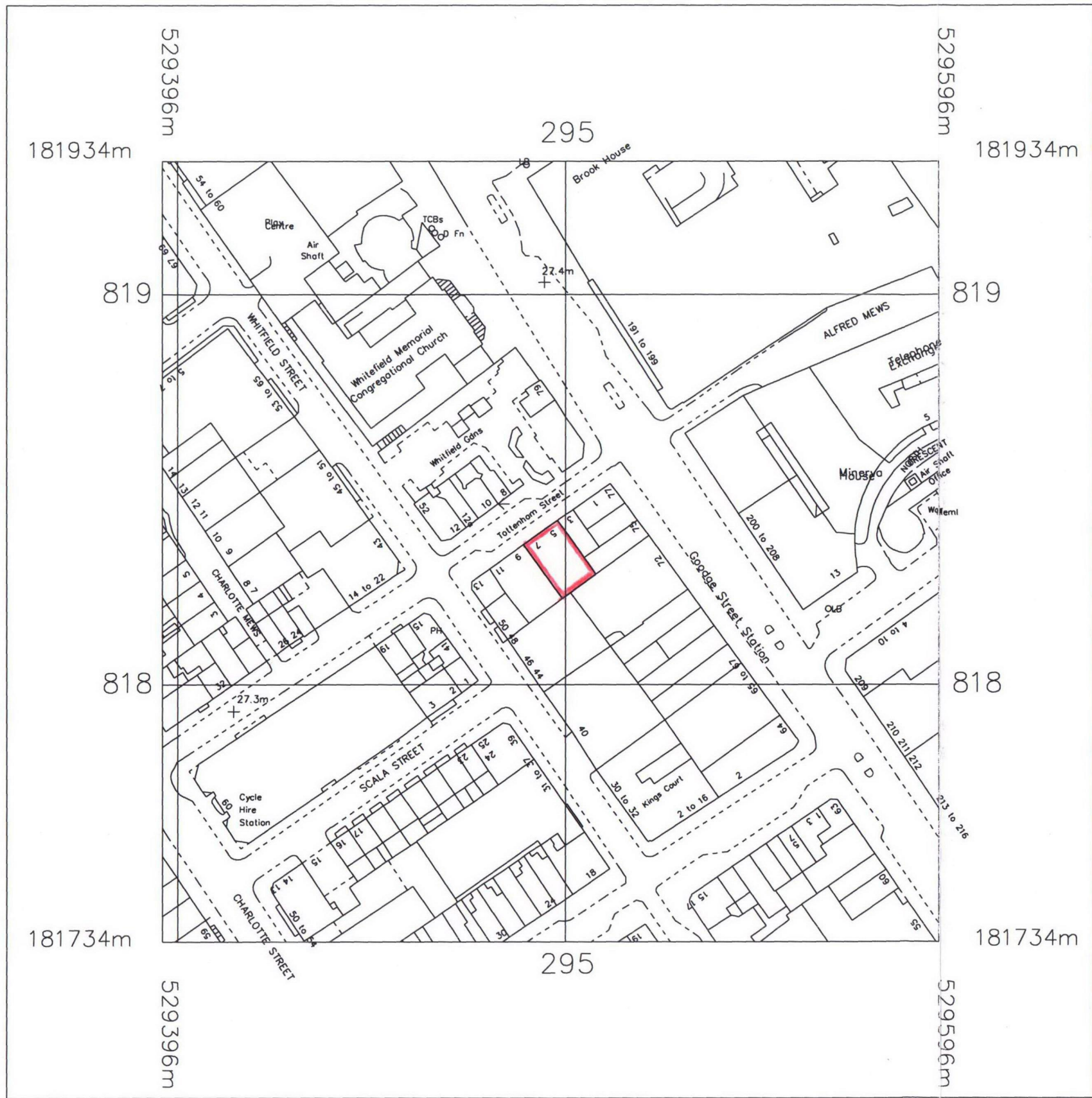
Location Plan - Scale 1:1250