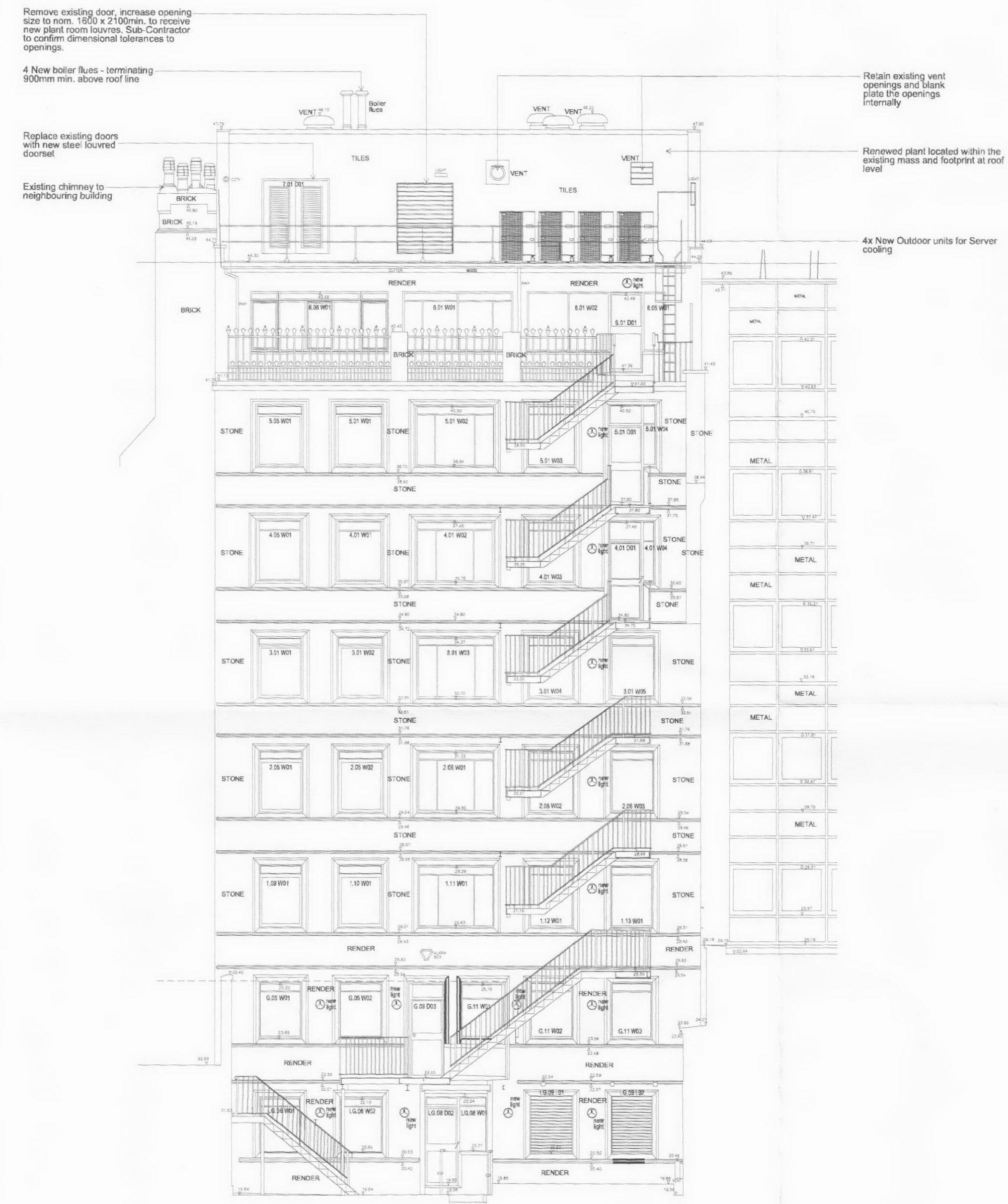
WEST ELEVATION : REAR - Approved scheme with proposed revisions