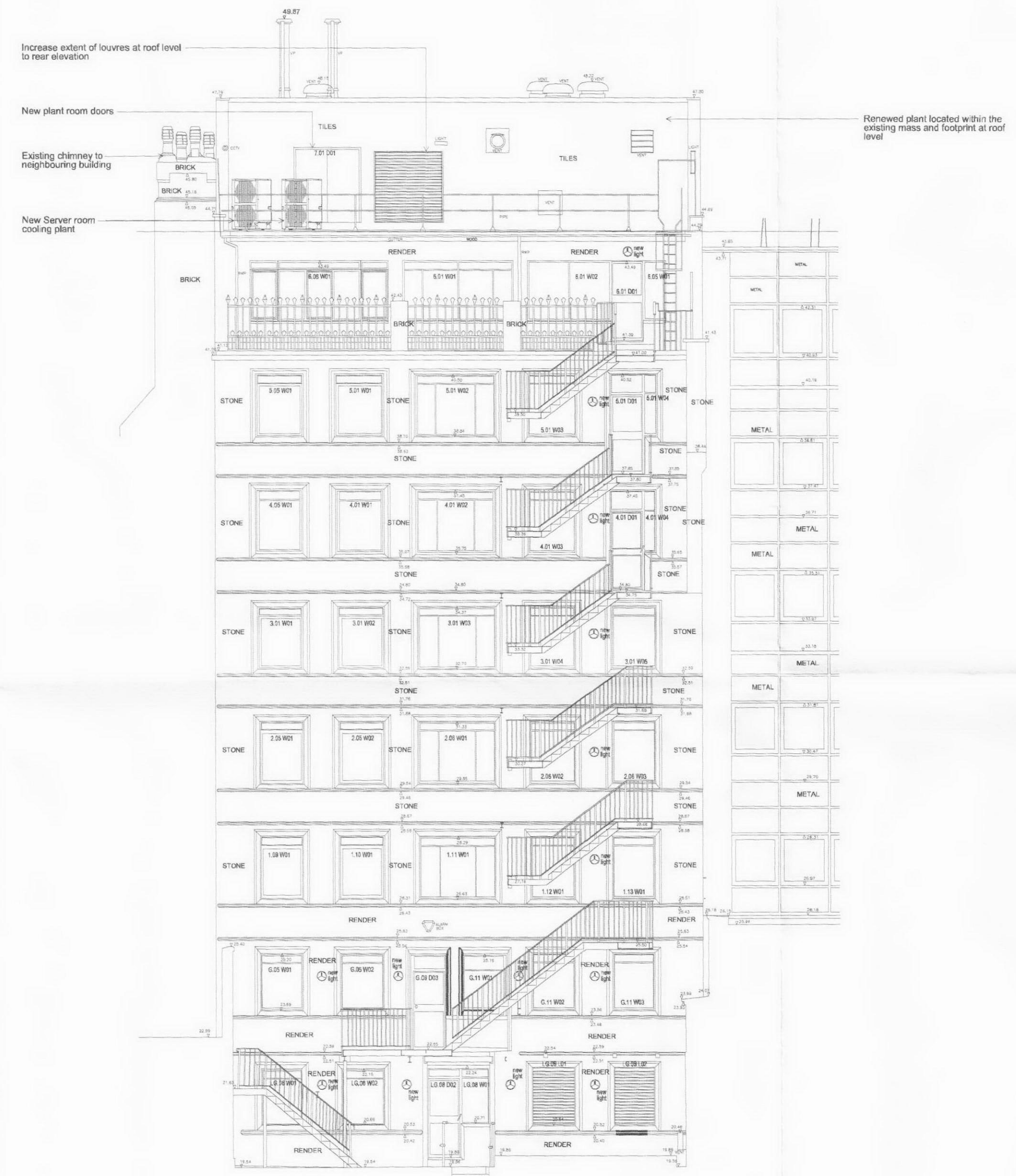
WEST ELEVATION : REAR - Existing Approved scheme