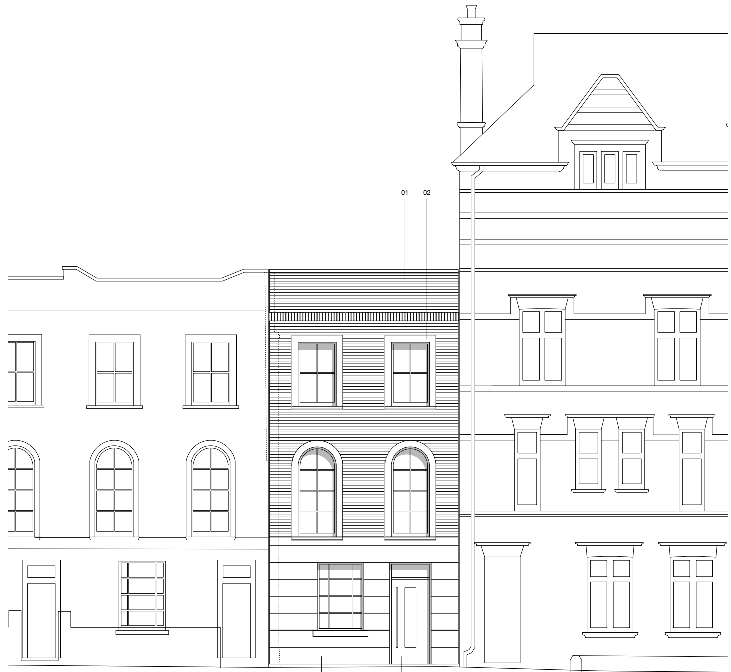
01 FRONT ELEVATION Scale : 1: 50