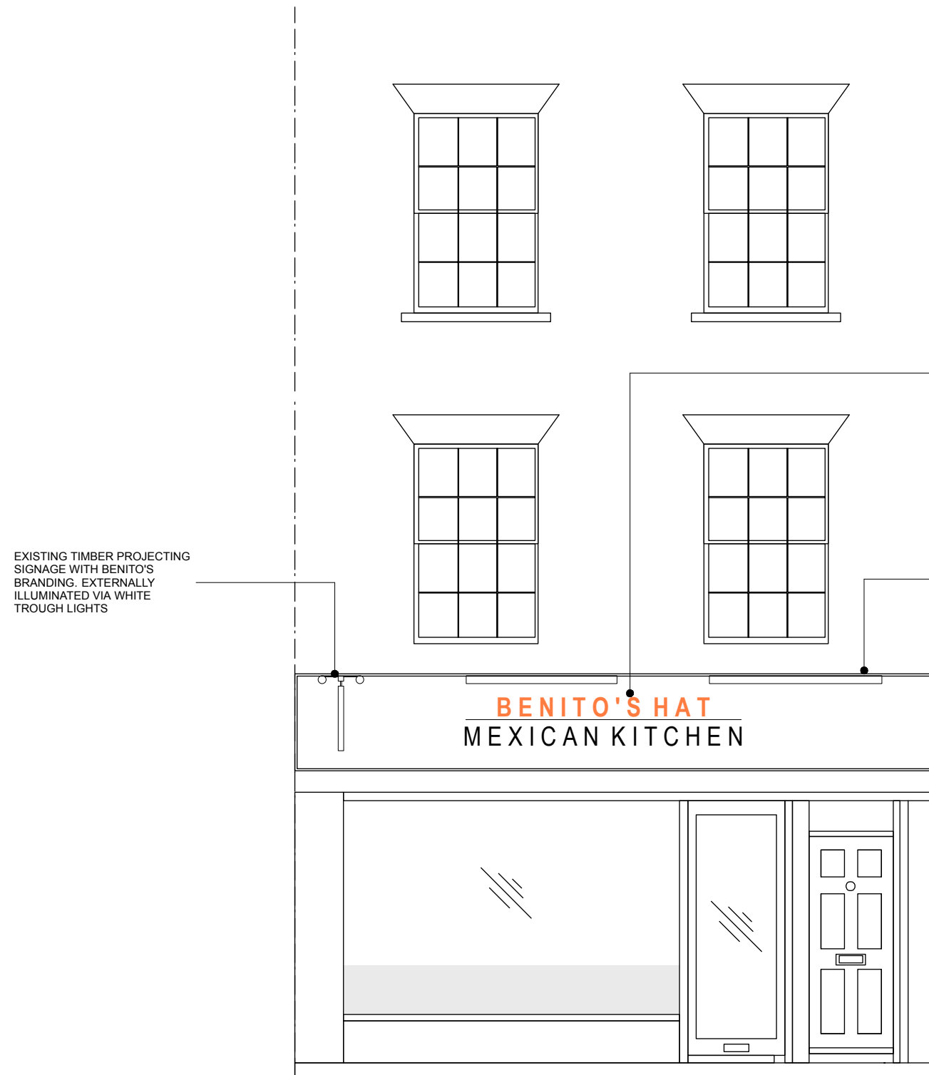
01 EXISTING ELEVATION A 200-01 Scale: 1:50